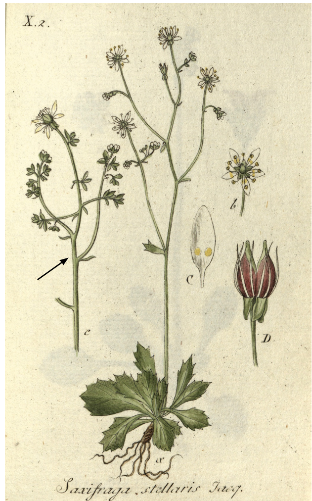
Fig./Abb. 2: Lectotypus of/von Saxifraga stellaris subsp. prolifera Temesy: Icon [tab. ad no. 3] " Saxifraga stellaris fig. e" in Sturm, Deutschl. Fl., Abth. I, Heft 35 (1813).

to Sternberg's plants from Carinthia and the illustration in Sturm, and presented in addition an elaborate description in Latin referring to these Alpine plants only, thus technically creating a new name at subspecific rank. However, this name is to be treated as homonym (ICN, Art. 53.3) of S. stellaris var. prolifera Sternb., which in turn is automatically homotypical (ICN, Art. 7.5) with S. stellaris var. comosa . Under the generic name Micranthes the combination is possible: Even if Gornall formally was referring to Sternberg's variety (but simultaneously excluding S. stellaris var. comosa ) his combination must be interpreted as identical with and therefore based on Temesy's subsp. prolifera . The lectotype figure (which represents plants from "alpibus ... Savi (Sausalpen dictis) in Carinthia ipse legi": STERNBERG 1810: 11, under his var. \beta ) is part of the protologue of Sternberg's variety as well as of Temesy's subspecies. The epitype sheet was collected in the region of Sternberg's "locus classicus" and was cited by Temesy.