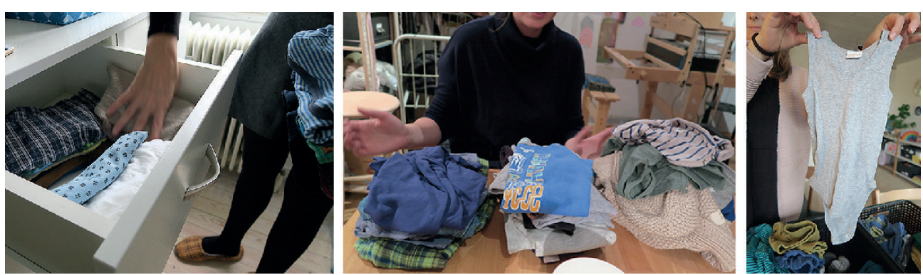
Figure 5. Interview part three: Wardrobe Study, functionality and use.

There is no doubt that comfort and usability is important for these mothers. Both of them emphasize this as their main preferences for choosing the baby