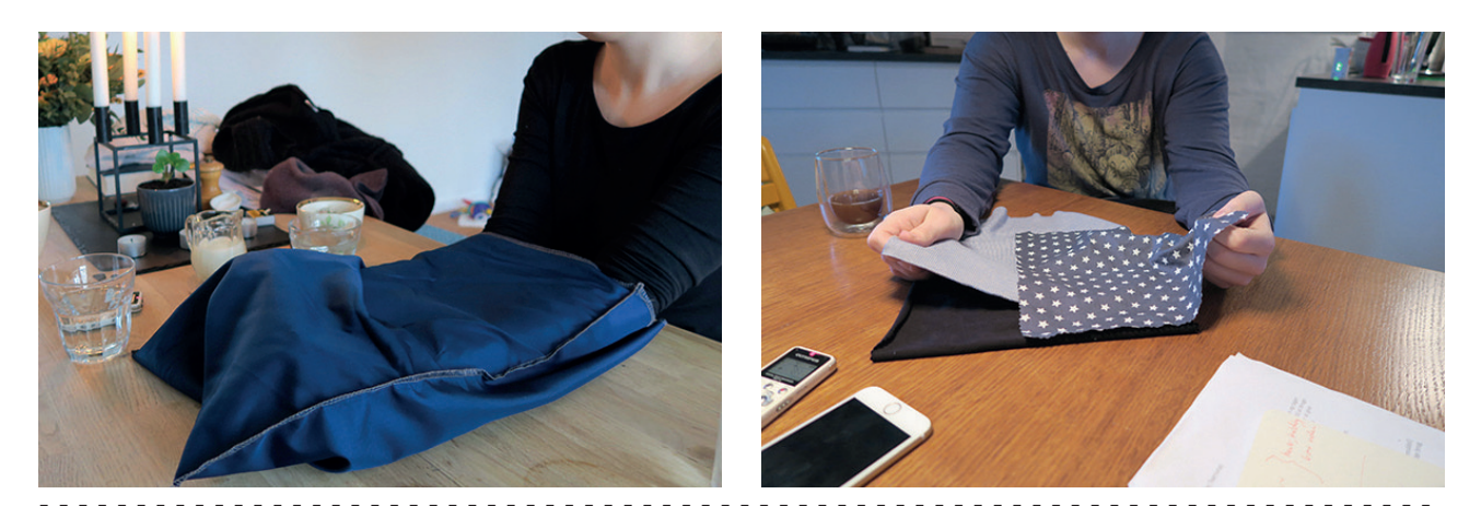
Figure 2. Interview part one: Repertory Grid, tactile and visual perception of fabric.

interview enabled the participant to further articulate and express emotional value. After the tactile investigation we asked the participants to repeat the exercise using visual perception. As it turned out the timeframe allowed each participant to investigate two of the three bags by the sense of touch as well as visually.