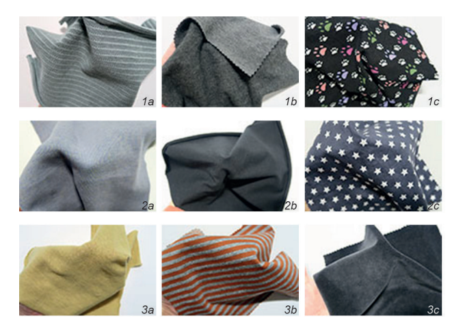
Figure 1. Textile triads 1.2. and 3.

were that they were suited for baby clothing and represented nine different types of textiles (tactile as well as visual). To represent different styles, the textiles vary in surface structure, color, mélange, stripes, graphic and naive print. We decided to let a few stand out e.g. the color black. The textiles are knitted or woven in different construction techniques. Five textiles are with a pattern and four are without. All textiles are cut in a proper size for handling, each one measuring 30*30 cm. Each triad of textiles is placed in a polyester bag that differ from the textiles. The bags measure 35*50 cm.