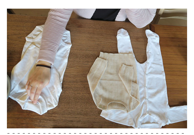
Figure 4. Interview part two: Repertory Grid, form and detail.