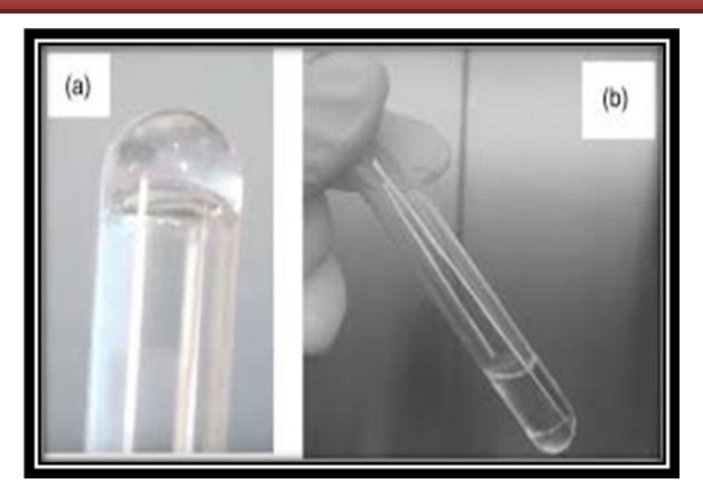
Fig.3- (a) Positive test – Gel get solidify and (b) Negative test – Gel remain in its liquid state.