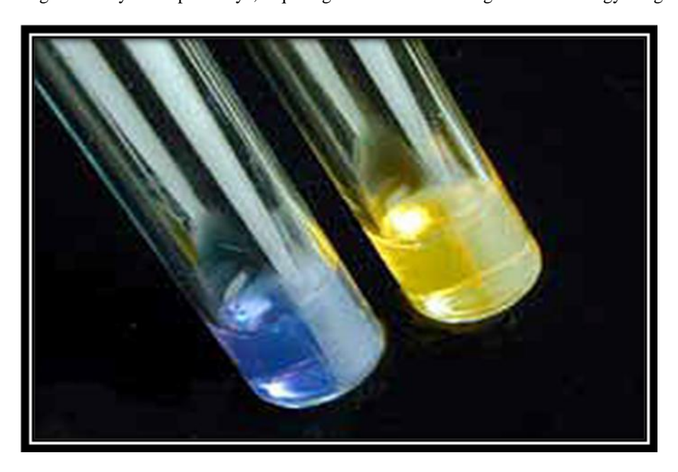
Fig.5- Blue color indicates negative test whereas Yellow color indicates positive test.

We can likewise utilize the chromogenic endpoint strategy for the subjective examination of endotoxins by means of the LAL test. The presence of shading is seen by the exposed eye, requiring less time of hatching than the strategy for gelation.