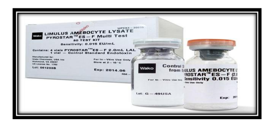
Fig.1-Commercially available LAL Test kit.

To play out the test, a measure of hemolymph of each crab is separated with a syringe and the creature is left in its condition. the natural procedure that happens in the hemolymph of the horseshoe crab within the sight of LPS, can see various separate actuation forms from professional catalysts to proteolytic proteins: - LPS enacts the response of star compound factor C autocatalytically in its change to initiated factor C; - The factor C, thus, enacts the factor B; - The factor B transforms the gel-shaping master chemical into a protein. The subsequent thickening protein is in charge of tying down the two peptide units in the coagulogen, shaping an insoluble gel. This particle is like as fibrinogen in arthropods.