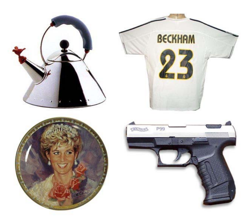
Figure 1 , Example celebrity products: Graves kettle, Beckham jersey, Diana plate, and Bond gun.

After collecting examples we clustered them, forming the following six categories: