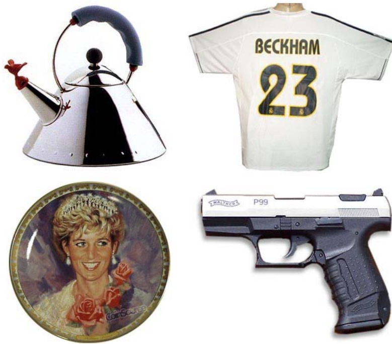
Figure 1 , Example celebrity products: Graves kettle, Beckham jersey, Diana plate, and Bond gun.

After collecting examples we clustered them, forming the following six categories: