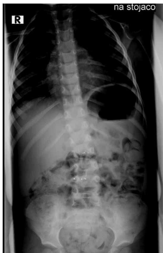
Fig. 1. After examining the child laboratory tests were collected, a viewing X-ray of chest and abdomen in standing position was ordered.

At the time of examination of the child in the emergency department of the children's ward by doctor on duty, child was in good general condition, efficient respiratorily and circulatorily, with features of upper respiratory tract infection- bloodshot throat and scarifical tonsils and fever 38,6 degree of Celsius.