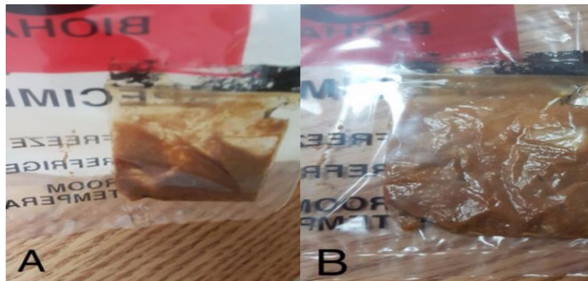
Figure 2: The plastic bag after it was retrieved from the patient and showing the brown material