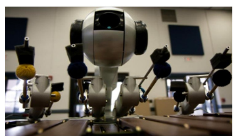
Fig3. Illustrates Shimon, a robot in the Center of Music Technology and School of Music.