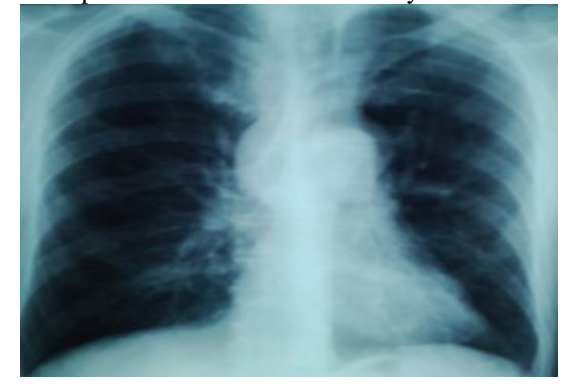
Fig 1:-chest radiograph objectified the presence of bilateral alveolar syndrome and latérotrachéale right opacity

Under antibiotic therapy (ceftriaxone and ciprofloxacin) associated with weekly infusions of 5 g of intravenous immunoglobulin, evolution was satisfactory, achieving a marked clinical improvement, biological and radiological.