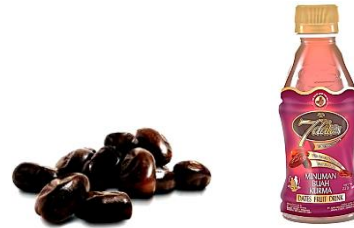
Figure 1. Sayer dates and 7dates

12 gr/dL (see table 1), having one or more symptoms of anemia, not consuming any iron supplements, and a willingness to consume either iron tablets, dates or 7dates. The exclusion criteria were girls with excess iron (hemocromatosis, hemosiderosis), anemia due to red-cell fragmentation (hemolytic anemia), disorders of red blood cells (porphyria, thalassemia), stomach ulceration (peptic ulceration) and colon ulceration (ulcerative colitis), alcohol drinkers and recipients of routine blood transfusions.