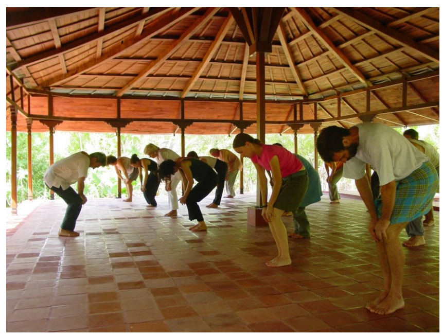
Fig 4. An Auroville classroom using natural ventilation and lighting

Most Auroville buildings ensure efficient ventilation and passive cooling techniques.