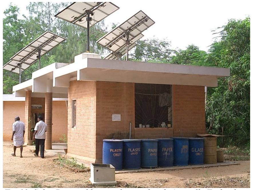
Fig 13. Solar Powered houses designed with Auroville Technology