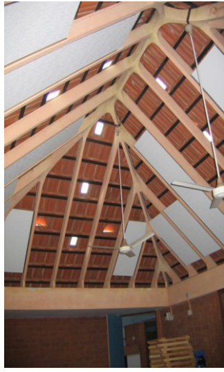
Fig 7. Another example of a sidelit room in Auroville