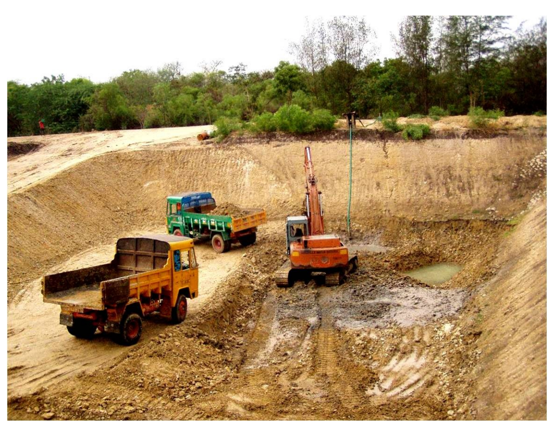
Fig 17. A trench being dug in Auroville for rainwater harvesting

Common adopted methods in Auroville include afforestation of wasteland areas, building recharge structures, repair of the feeding channels to the tanks and awareness activities for farmers.