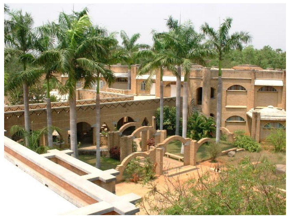
Fig 8. Auroville's Visitor's Centre made out of compressed earth bricks

A very high compression of upto 1.83 with 15 tons available force is achieved by the range of presses designed in Auroville