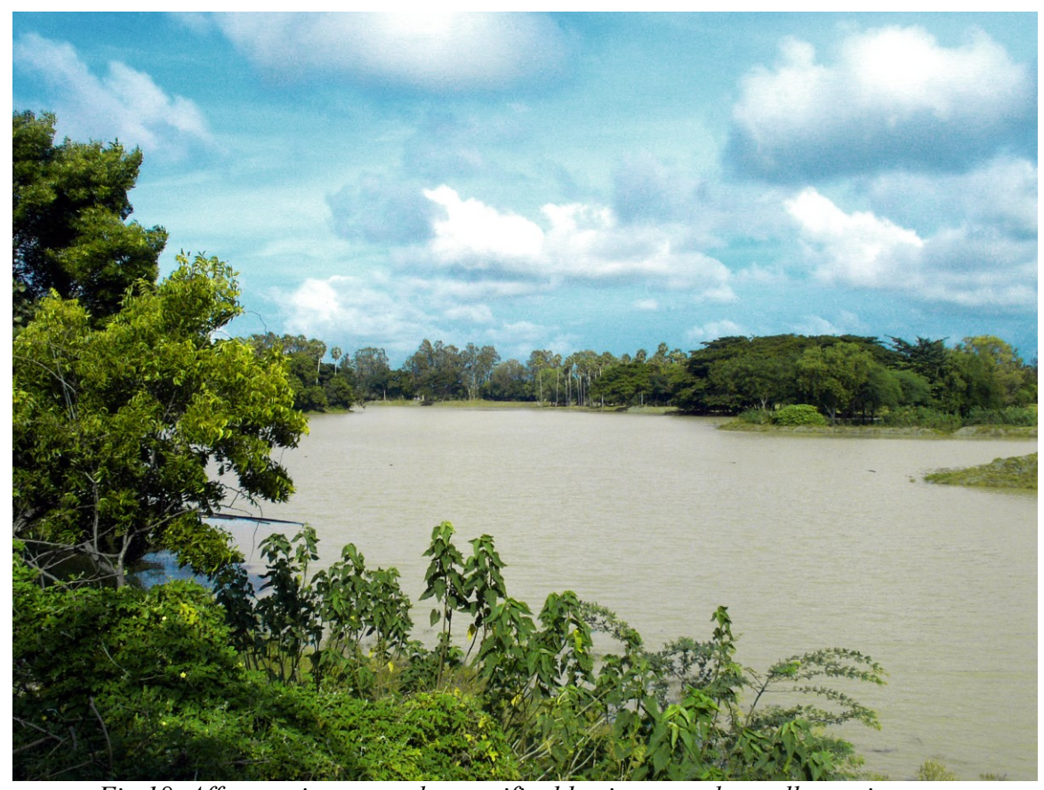
Fig 18. Afforestation around an artifical basin created to collect rainwater