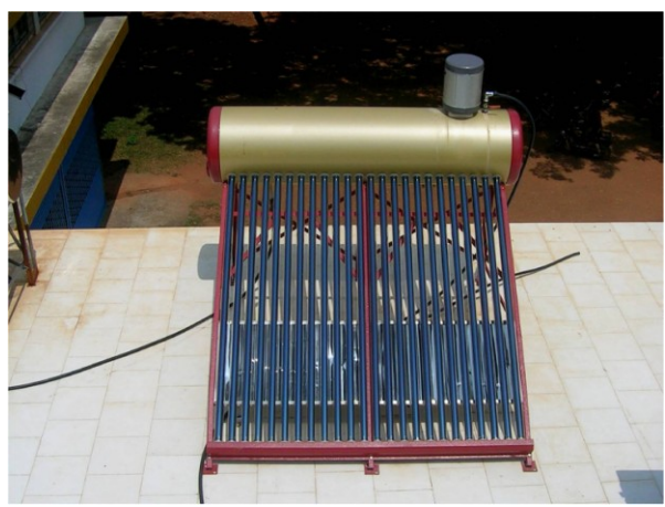
Fig 11. Solar Water Heater used in Auroville

Solar water heating systems are generally composed of solar thermal collectors, a fluid system to move the heat from the collector to its point of usage and a reservoir or tank for heat storage and subsequent use. The systems may be used to heat domestic hot water, swimming pool water, or for space heating. The heat can also be used for industrial applications or as an energy input for other uses such as cooling equipment.