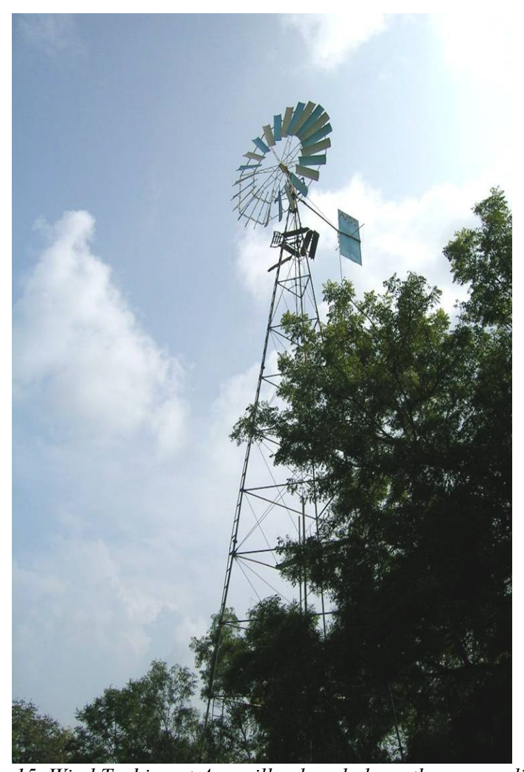
Fig 15. Wind Turbine at Auroville placed above the canopy line

Auroville receives unobstructed wind being on the coast of the Bay of Bengal. The aerodynamic drag induced by the forested canopy in Auroville slows down the wind speed to a certain extent – wind turbine rotor blades are therefore located at a height just above the forested canopy. Research is still underway to extract wind power effectively.