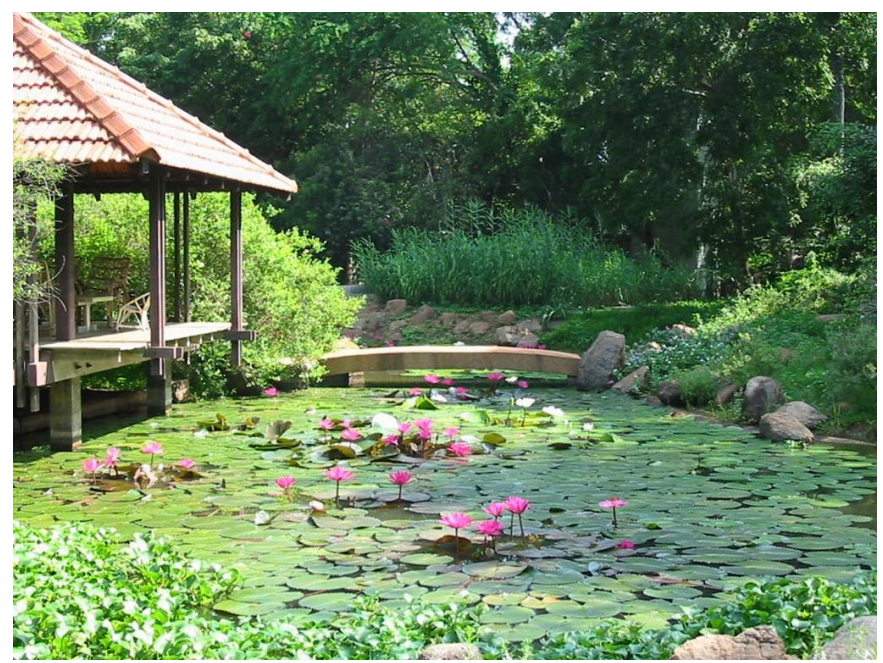
Fig.1 An aesthetically pleasing and a kind microclimate for the Afsaana's Guest house in Auroville