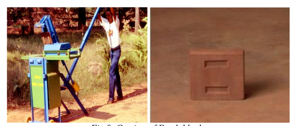
Fig 9. Casting of Earth blocks

In addition Auroville is experimenting with ecological walling systems. For example, straw bale buildings utilize normal sized agricultural straw bale which are rendered on the outer skin, to provide protection from the rain and plastered on the inside. This type of wall gives low U-values and is considered as a sustainable material since carbon dioxide is absorbed by the material as it grows and little energy is used to construct the walls.