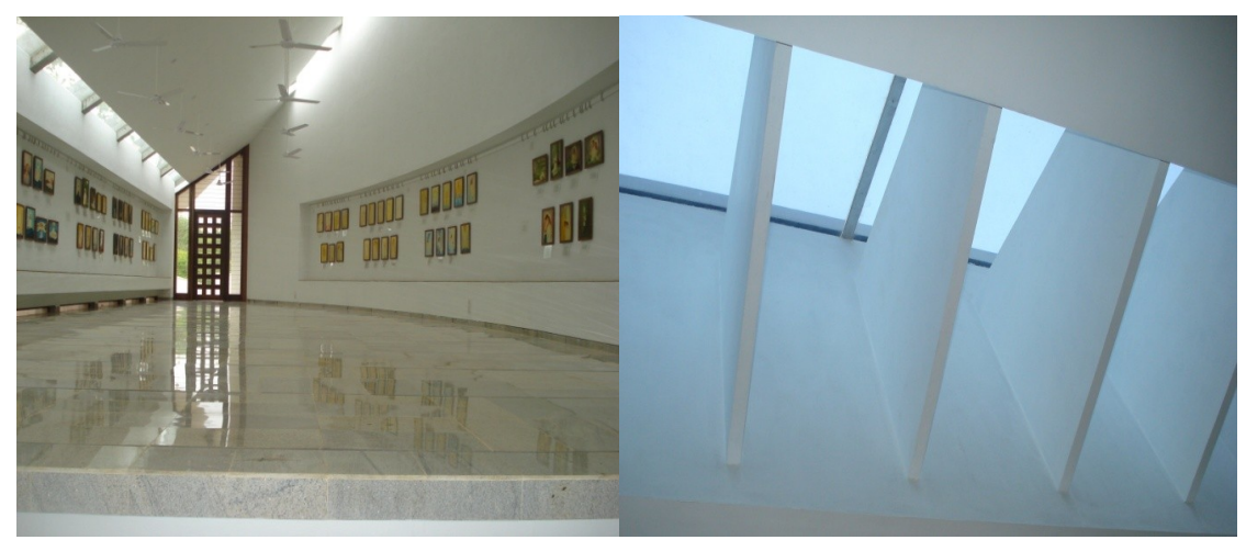
Fig 5. Efficient use of daylighting at Savitri Bhavan

The potential from energy savings from daylight are large. The greatest savings in energy occur when in spaces where illumination in daylight is preferable to artificial illumination.