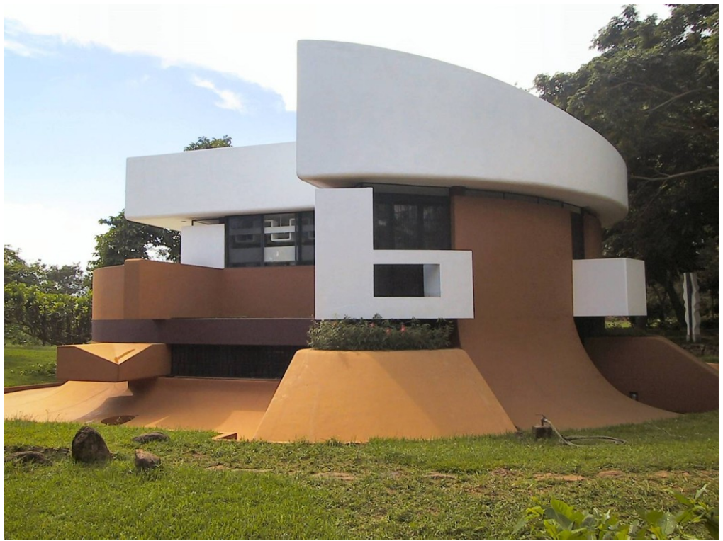
Fig 3. A Building in Auromodele demonstrating the nuances of a superior Building Form

Note the sweeping curves and open spaces encouraging the free flow of air. The form is such that it receives optimum daylight without heating the building excessively which minimizes the use of artificial lighting and cooling.