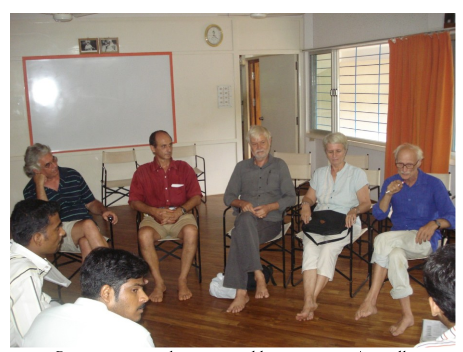
Discussion regarding sustainable practices at Auroville