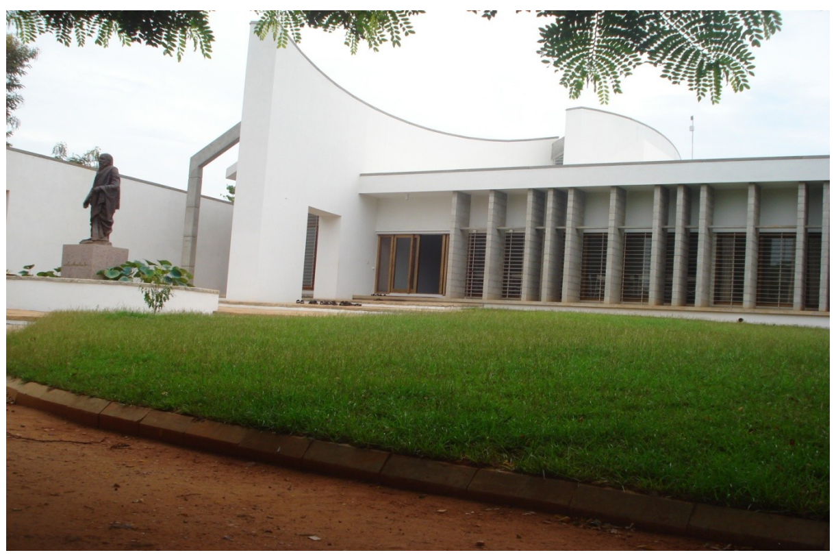
Fig 2. Savitri Bhavan: Ranch type design with added features to optimize daylight gains

Auroville has experimented with building forms right from its inception. Starting from the basic A huts in the early 70's, Auroville architecture has come a long way – Auroville architectural styles now famous the world over – combine unique forms built with sustainable building fabrics and the resulting buildings are perfectly adapted to the local microclimate. There are many factors that have an influence on the form of a building. Cost is a major factor here and simple cubical buildings are less expensive than complex forms. Functional requirements and aesthetics also have an important role in deciding the form.