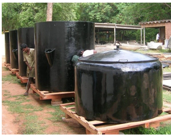
Fig 14. A Biogas tank

Buildings are constructed so that humans can carry out their various activities in an appropriate environment, efficiently, safely and in thermal comfort. The shell of a building is a barrier between the varying external environment, which can be uncomfortably hot or cold and stable comfortable internal environment. The building fabric acts as a moderator of climate but it is usual, during seasonal extremes, to use energy to maintain internal conditions.