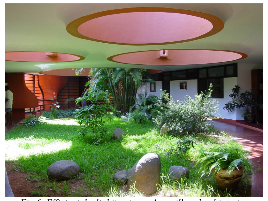
Fig 6. Efficient daylighting in an Auroville school interior

The potential from energy savings from daylight are large. The greatest savings in energy occur when in spaces where illumination in daylight is preferable to artificial illumination.