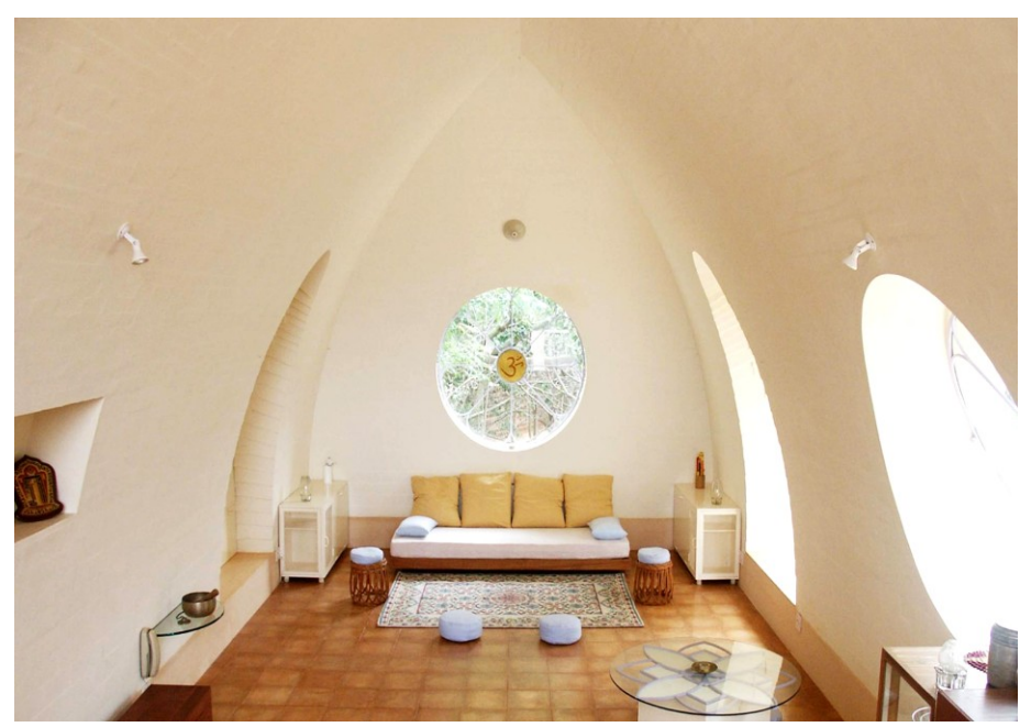
Fig 6. Interior of an Auroville house optimizing on daylighting

The majority of rooms are daylit using vertical side windows. There is a problem in illuminating rooms this way as daylight is mostly available near the window but finds difficulty in spreading to the points furthest from it. Auroville has experimented various methods to improve the spread of daylight by using side lit rooms. The philosophy is to change the direction of light flow so that instead of pooling near the window, it is projected up to the ceiling and reflected to the rear of the room.