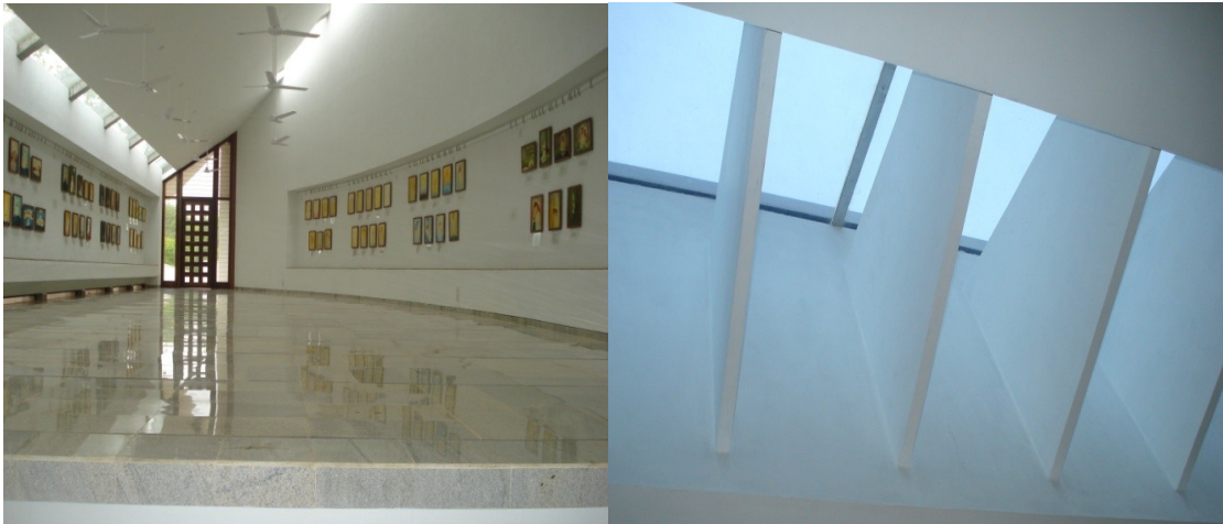
Fig 5. Efficient use of daylighting at Savitri Bhavan

The potential from energy savings from daylight are large. The greatest savings in energy occur when in spaces where illumination in daylight is preferable to artificial illumination.