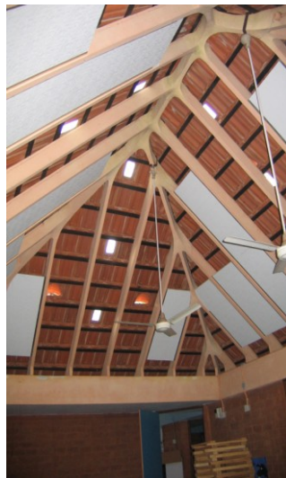
Fig 7. Another example of a sidelit room in Auroville