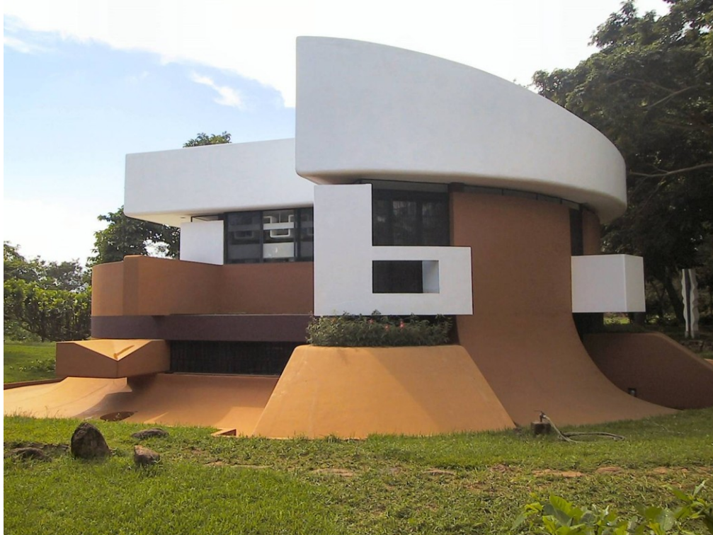
Fig 3. A Building in Auroville demonstrating the nuances of a superior Building Form

Note the sweeping curves and open spaces encouraging the free flow of air. The form is such that it receives optimum daylight without heating the building excessively which minimizes the use of artificial lighting and cooling.