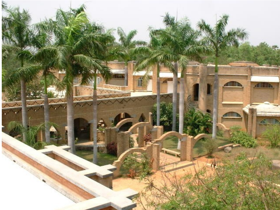
Fig 8. Auroville's Visitor's Centre made out of compressed earth bricks

A very high compression of upto 1.83 with 15 tons available force is achieved by the range of presses designed in Auroville