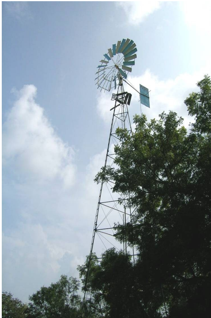
Fig 15. Wind Turbine at Auroville placed above the canopy line

Auroville receives unobstructed wind being on the coast of the Bay of Bengal. The aerodynamic drag induced by the forested canopy in Auroville slows down the wind speed to a certain extent – wind turbine rotor blades are therefore located at a height just above the forested canopy. Research is still underway to extract wind power effectively.