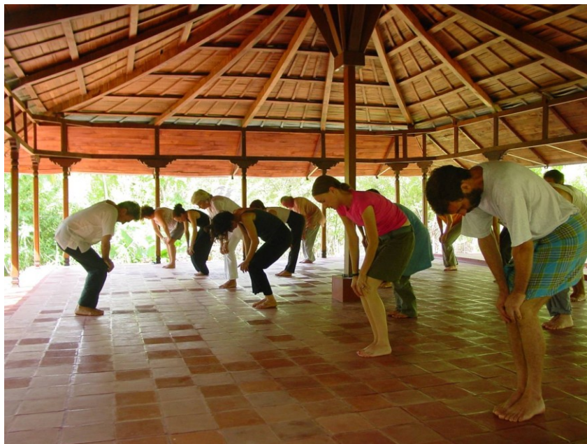
Fig 4. An Auroville classroom using natural ventilation and lighting

Most Auroville buildings ensure efficient ventilation and passive cooling techniques.