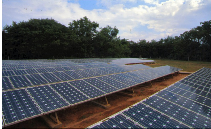
Fig 12. Photovoltaic Panel Array