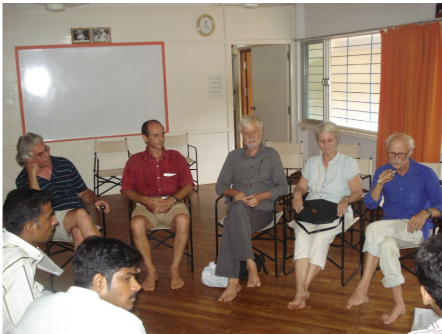
Discussion regarding sustainable practices at Auroville