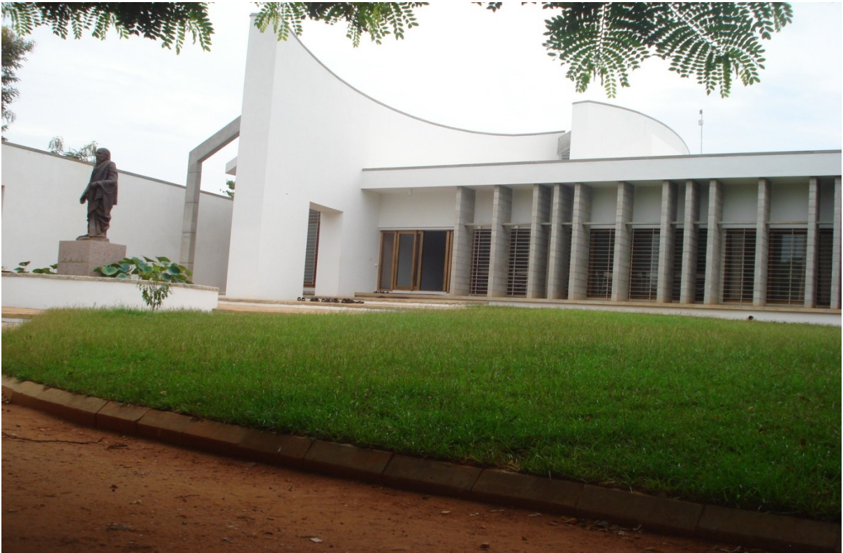
Fig 2. Savitri Bhavan: Ranch type design with added features to optimize daylight gains

Auroville has experimented with building forms right from its inception. Starting from the basic A huts in the early 70's, Auroville architecture has come a long way – Auroville architectural styles now famous the world over – combine unique forms built with sustainable building fabrics and the resulting buildings are perfectly adapted to the local microclimate. There are many factors that have an influence on the form of a building. Cost is a major factor here and simple cubical buildings are less expensive than complex forms. Functional requirements and aesthetics also have an important role in deciding the form.