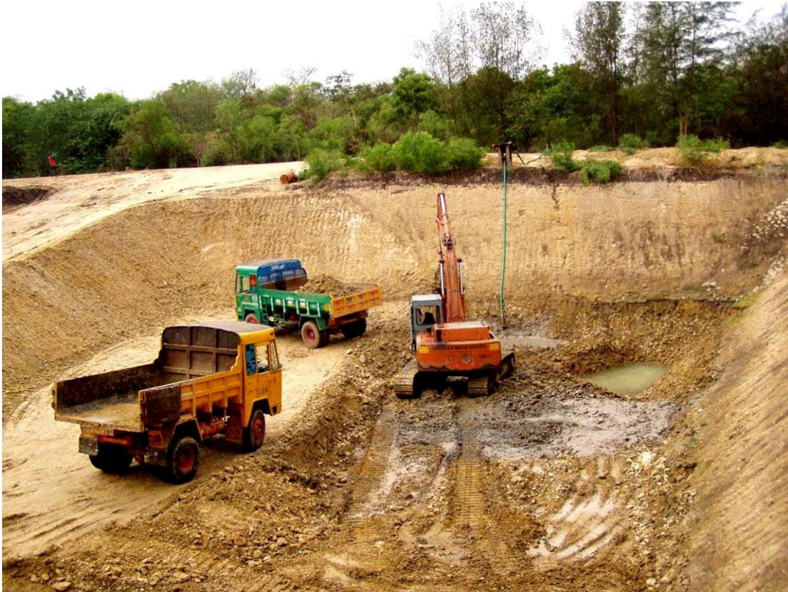
Fig 17. A trench being dug in Auroville for rainwater harvesting

Common adopted methods in Auroville include afforestation of wasteland areas, building recharge structures, repair of the feeding channels to the tanks and awareness activities for farmers.