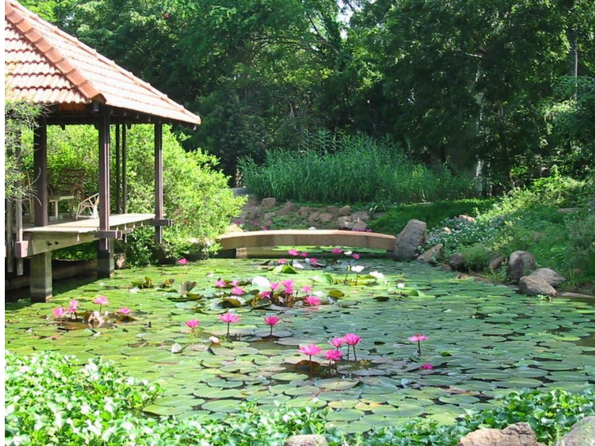
Fig.1 An aesthetically pleasing and a kind microclimate for the Afsaana's Guest house in Auroville