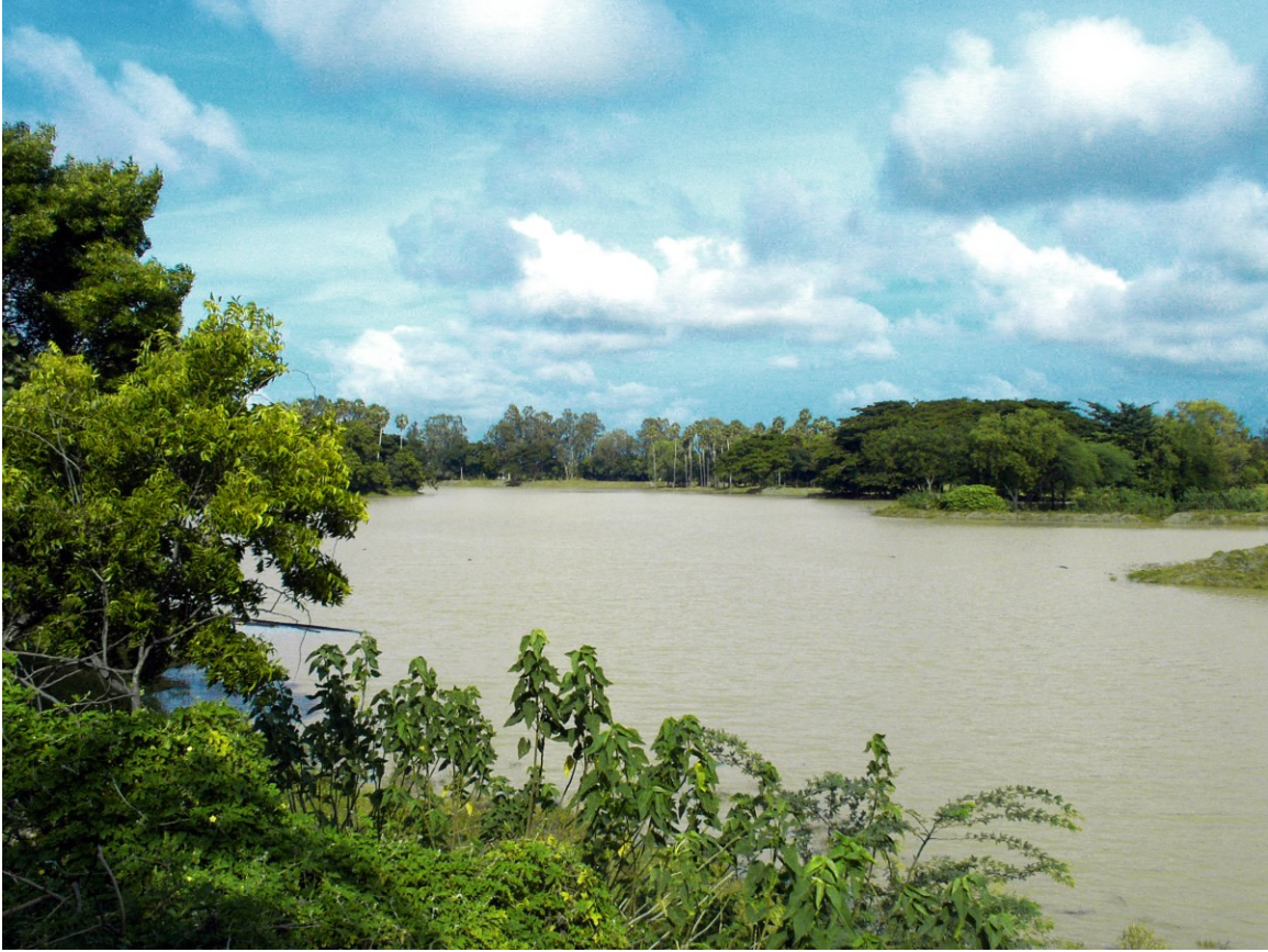
Fig 18. Afforestation around an artificial basin created to collect rainwater