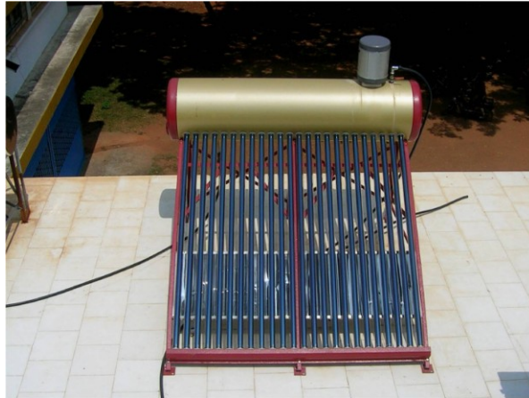
Fig 11. Solar Water Heater used in Auroville

Solar water heating systems are generally composed of solar thermal collectors, a fluid system to move the heat from the collector to its point of usage and a reservoir or tank for heat storage and subsequent use. The systems may be used to heat domestic hot water, swimming pool water, or for space heating. The heat can also be used for industrial applications or as an energy input for other uses such as cooling equipment.