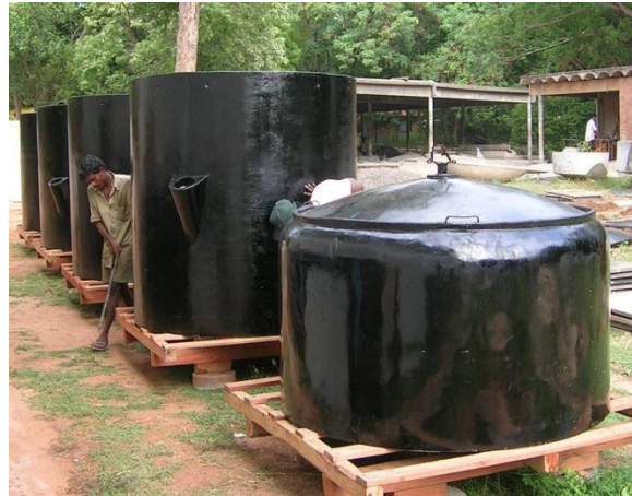
Fig 14. A Biogas tank

Buildings are constructed so that humans can carry out their various activities in an appropriate environment, efficiently, safely and in thermal comfort. The shell of a building is a barrier between the varying external environment, which can be uncomfortably hot or cold and stable comfortable internal environment. The building fabric acts as a moderator of climate but it is usual, during seasonal extremes, to use energy to maintain internal conditions.