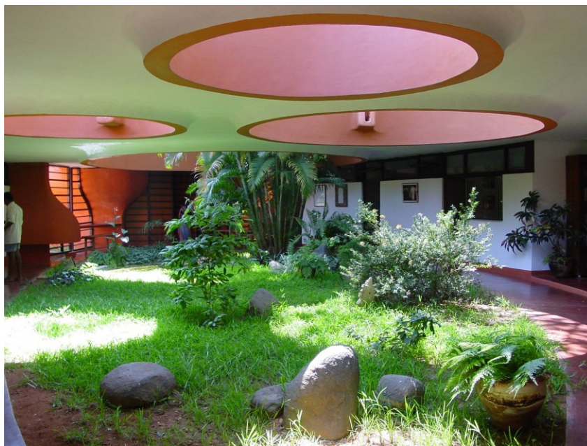
Fig 6. Efficient daylighting in an Auroville school interior

The potential from energy savings from daylight are large. The greatest savings in energy occur when in spaces where illumination in daylight is preferable to artificial illumination.