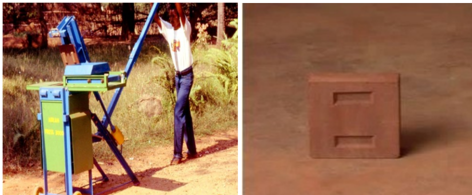
Fig 9. Casting of Earth blocks

In addition Auroville is experimenting with ecological walling systems. For example, straw bale buildings utilize normal sized agricultural straw bale which are rendered on the outer skin, to provide protection from the rain and plastered on the inside. This type of wall gives low U-values and is considered as a sustainable material since carbon dioxide is absorbed by the material as it grows and little energy is used to construct the walls.