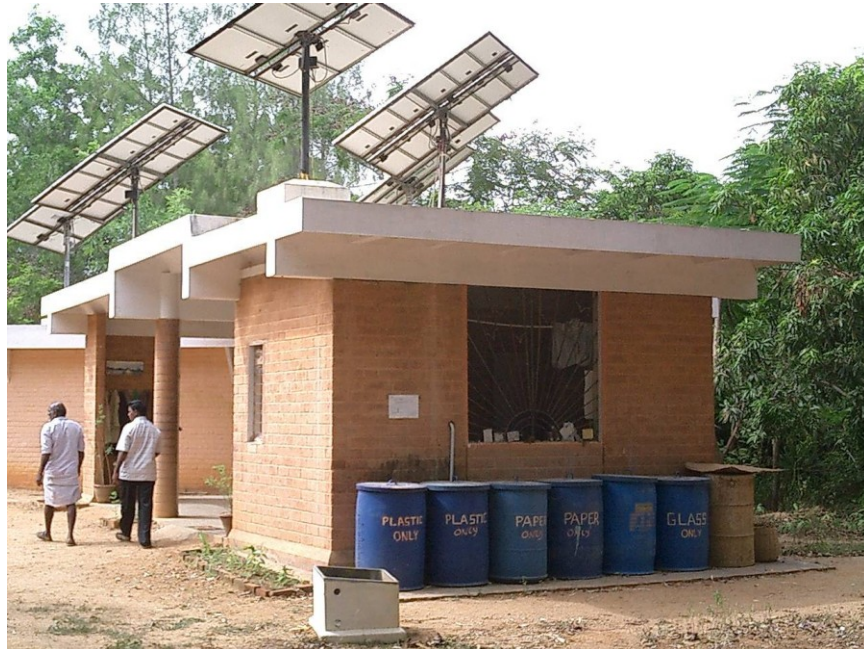
Fig 13. Solar Powered houses designed with Auroville Technology