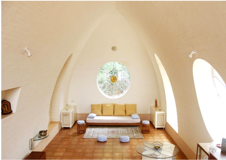
Fig 6. Interior of an Auroville house optimizing on daylighting

The majority of rooms are daylit using vertical side windows. There is a problem in illuminating rooms this way as daylight is mostly available near the window but finds difficulty in spreading to the points furthest from it. Auroville has experimented various methods to improve the spread of daylight by using side lit rooms. The philosophy is to change the direction of light flow so that instead of pooling near the window, it is projected up to the ceiling and reflected to the rear of the room.