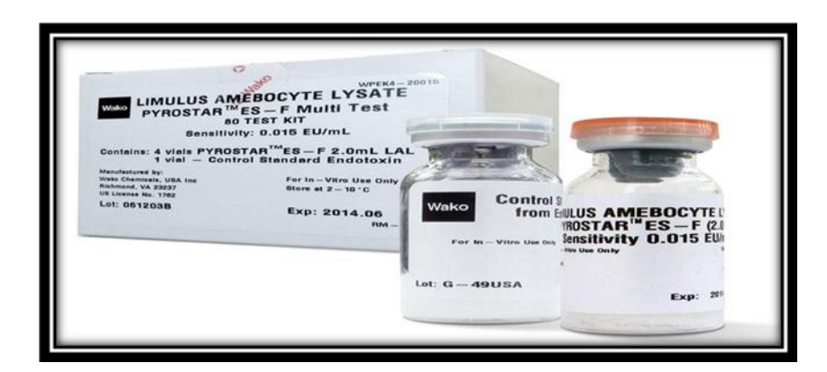
Fig.1-Commercially available LAL Test kit.

To play out the test, a measure of hemolymph of each crab is separated with a syringe and the creature is left in its condition. the natural procedure that happens in the hemolymph of the horseshoe crab within the sight of LPS, can see various separate actuation forms from professional catalysts to proteolytic proteins: - LPS enacts the response of star compound factor C autocatalytically in its change to initiated factor C; - The factor C, thus, enacts the factor B; - The factor B transforms the gel-shaping master chemical into a protein. The subsequent thickening protein is in charge of tying down the two peptide units in the coagulogen, shaping an insoluble gel. This particle is like as fibrinogen in arthropods.