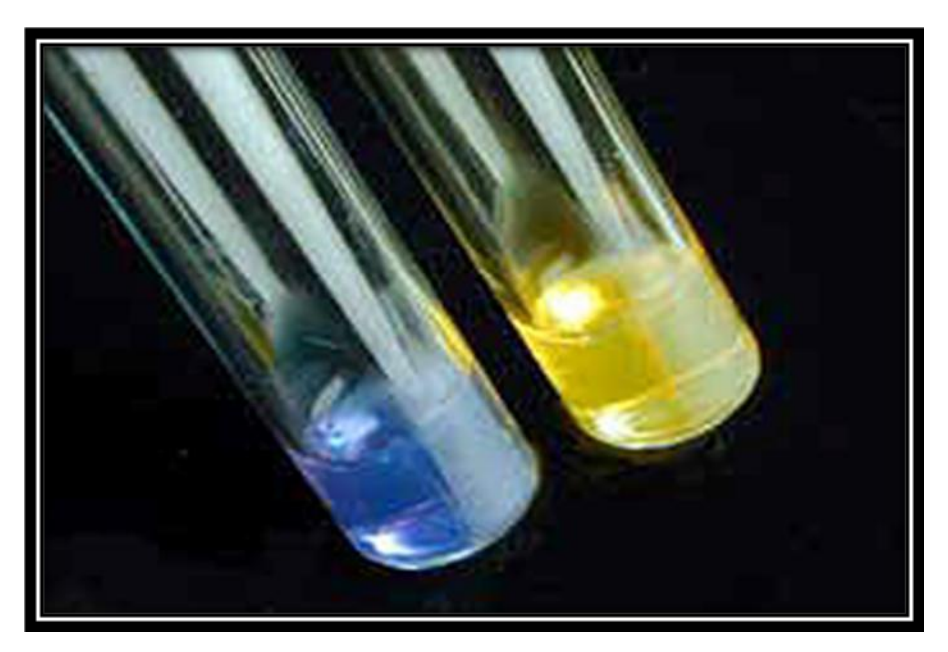
Fig.5- Blue color indicates negative test whereas Yellow color indicates positive test.

We can likewise utilize the chromogenic endpoint strategy for the subjective examination of endotoxins by means of the LAL test. The presence of shading is seen by the exposed eye, requiring less time of hatching than the strategy for gelation.