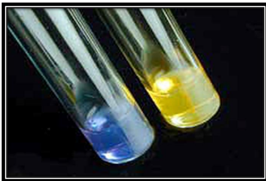
Fig.5- Blue color indicates negative test whereas Yellow color indicates positive test.

We can likewise utilize the chromogenic endpoint strategy for the subjective examination of endotoxins by means of the LAL test. The presence of shading is seen by the exposed eye, requiring less time of hatching than the strategy for gelation.