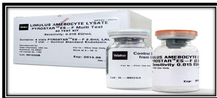
Fig.1-Commercially available LAL Test kit.

To play out the test, a measure of hemolymph of each crab is separated with a syringe and the creature is left in its condition. the natural procedure that happens in the hemolymph of the horseshoe crab within the sight of LPS, can see various separate actuation forms from professional catalysts to proteolytic proteins: - LPS enacts the response of star compound factor C autocatalytically in its change to initiated factor C; - The factor C, thus, enacts the factor B; - The factor B transforms the gel-shaping master chemical into a protein. The subsequent thickening protein is in charge of tying down the two peptide units in the coagulogen, shaping an insoluble gel. This particle is like as fibrinogen in arthropods.