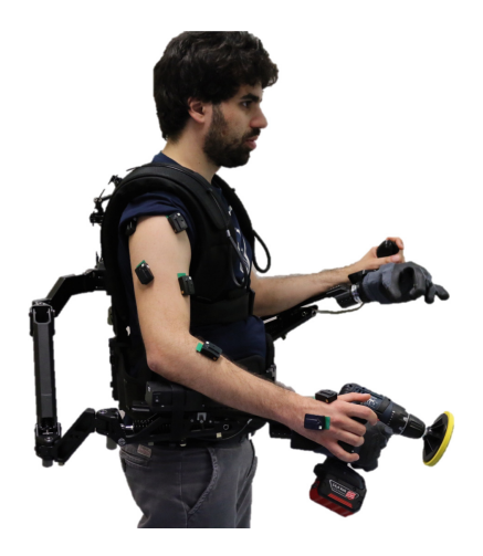
Fig. 1. The proposed supernumerary soft robotic hand-arm system.

Noteworthy, most of these devices only reduce the payload on the arm joints, leaving the fingers still overloaded for grasping. In addition, this could be painful especially using vibrational tool (e.g. drill or polisher). In fact, vibration transmission on the hand/arm have been correlated with chronic nerve and tendon disorders [4]. Some industrial solutions (e.g. www.deltaregis.com/Tool_Supports) already deal with this problem, but they are usually grounded, limiting the natural workspace. To address these challenges, we present a new wearable and under-actuated soft robotic platform. The system is composed of the Pisa/IIT SoftHand [5] mounted on a commercial steady-cam (Armor Man 2.0, Tilta), with four passive dampers in between. The whole system reduces the load on both the arm and finger joints during tasks. In addition, since the user does not hold the tool directly with his/her own hand, most of the vibration are dissipated by the system, highly reducing the injury risk on the nerves and tendons. A detailed description of the system, and its potential to improve human ergonomics is provided below.