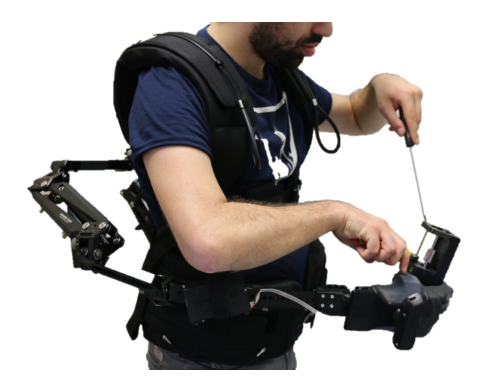
Fig. 3. The system can hold a part for the worker while using two hands to manipulate it.