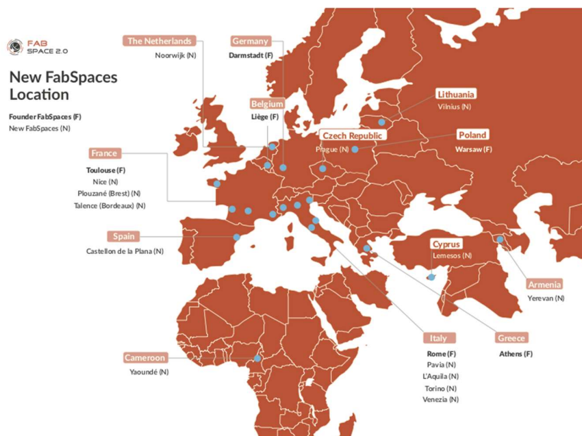
Figure 3: The FabSpace 2.0 Network