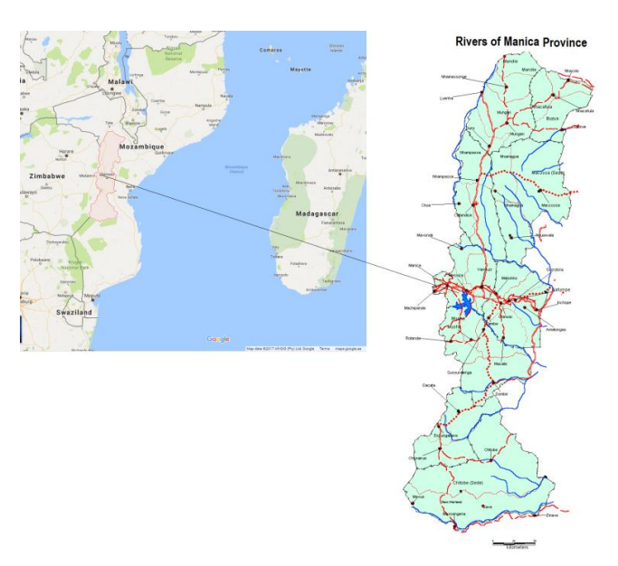
Figure 1: Chimenza river – Manica, Mozambique.

The case used in this study Chimenza river - Manica. According to water availability, access, elevation and topography of the site 18°55'33.4"S 32°47'30.3"E (figure 1) it was selected for the measurement of the head and flow discharge. Flow was measured for one year and annual historical flow data for the last 12 years was supplied by National Meteorological Service of Mozambique. The head was 65m.