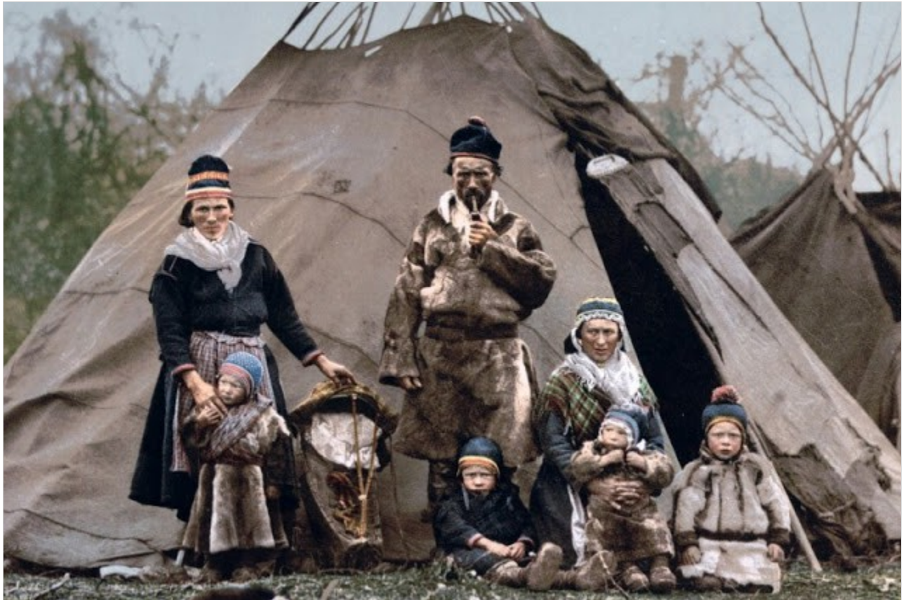
A portrait of a family in the Sami nomadic culture around 1900.

While language contained/contains the basic concepts about time, the customs and rituals of the civilization, the technology, and the belief systems reflected/reflect the sense of time that was/is in place during each era. They, in turn, also affected/affect concepts and ideas about time in the language.