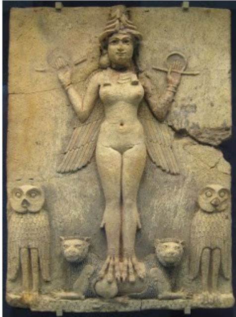
The sacred, powerful and central Babylonian goddess Ishtar. Her symbol was the star and she was associated with the planet Venus. " 'Burney Relief'...from about 1800-1750 BC."

In a sense the Babylonian empire invented modern time. As one of the first large empires and bureaucracies in the West, it needed to manage time on a daily basis in a systematic and orderly fashion. Managing such a far-flung empire with millions of people would have been very difficult otherwise.