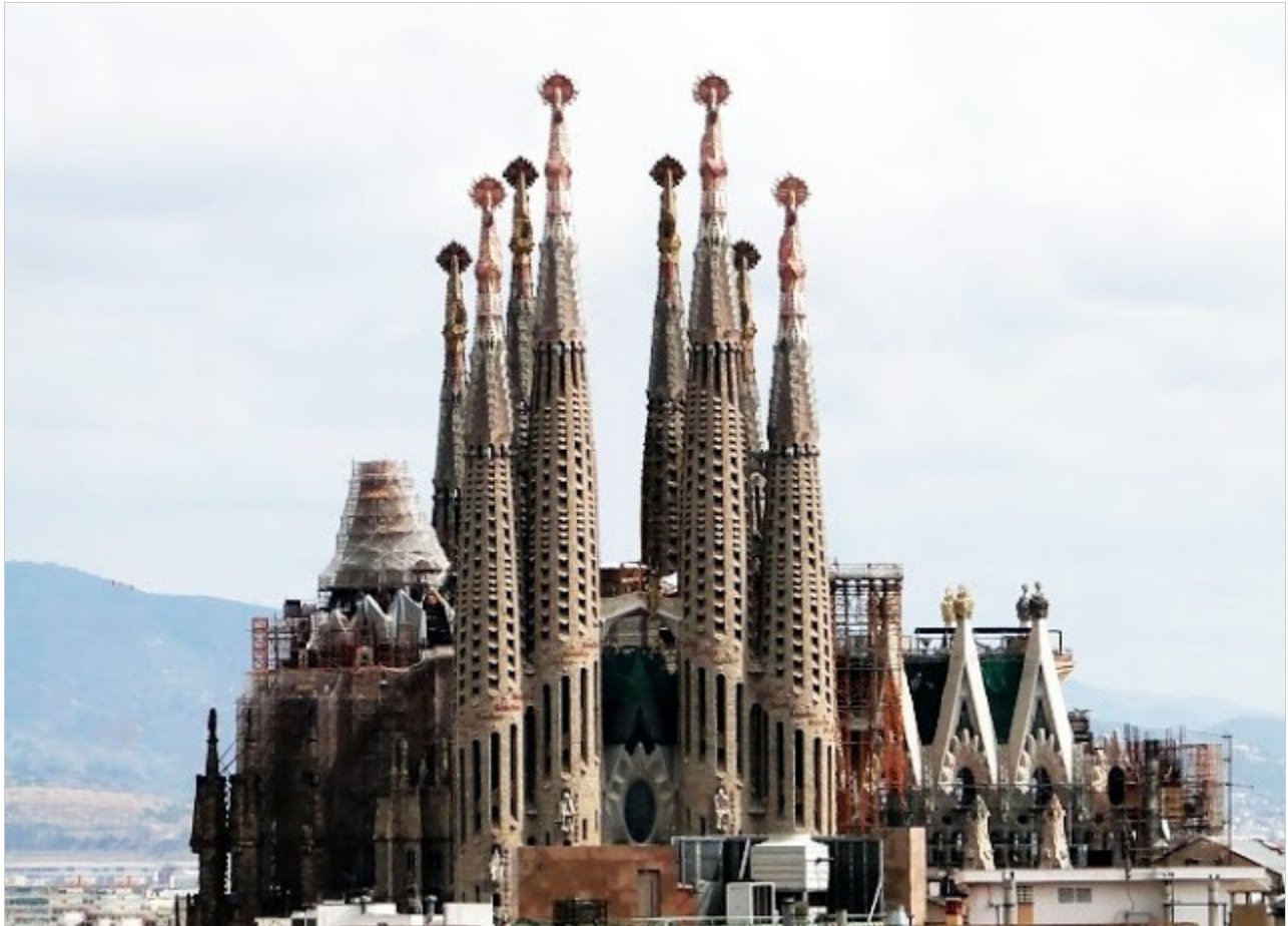
Gaudi's Sagrada Família (Church of the Holy Family) in Barcelona Spain which has taken more than a century to build and will not be completed until 2026.