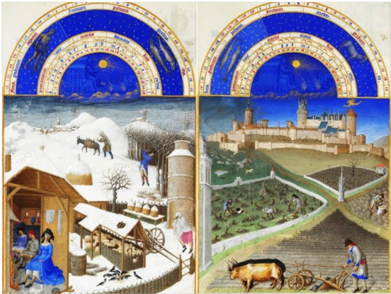
The seasonal cyclical panels from Les Tres Riches Heures du Duc de Berry , ca. 1400.

So the clock was first used in monasteries to provide an accurate way to regulate the activities of monks. The clock, in the beginning, was about cyclical repeating time as was the era of the Middle Ages. Soon clocks were everywhere in Europe but they often showed not just the time but the position of the heavenly bodies. Humans had now, in a sense, made a copy of God's handiwork and brought it down to Earth. The round clock symbolized the repeating and cyclical nature of time.