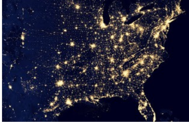
Composite night shot of electric lighting in the United States in the eastern states.

Modern time is decidedly linear. Because we are in a scientific age with significant technological innovations, we know that new discoveries built on old knowledge are the order of the day. Technology is changing rapidly, so rapidly you can be sure that when you buy the latest cell phone it will be out of date in a couple of months or a year at the most.