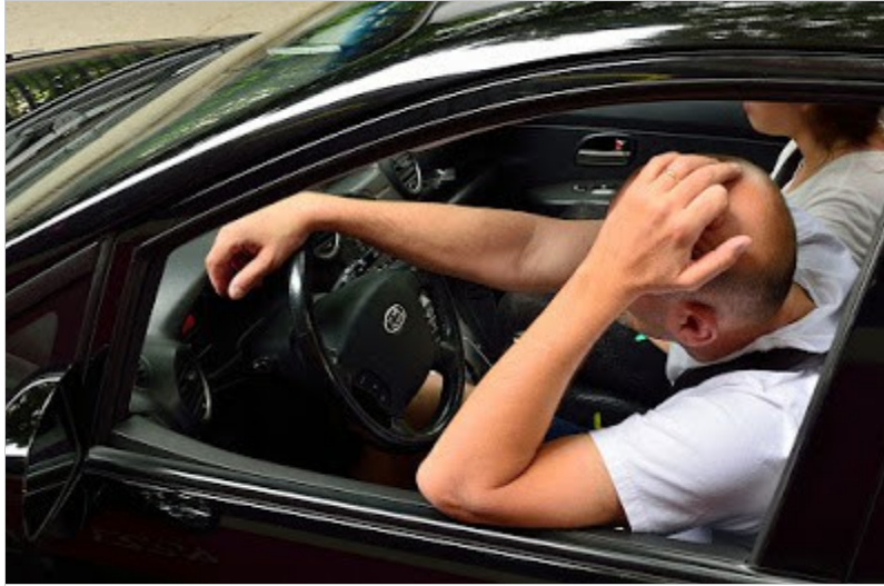
Traffic frustration in the modern world of grid-lock.

For example, a professor I knew who worked at a stressful job at a major university, would immediately dig in his garden after work so that he could unwind. The contact with dirt and natural plants helped him restore his own natural rhythm.