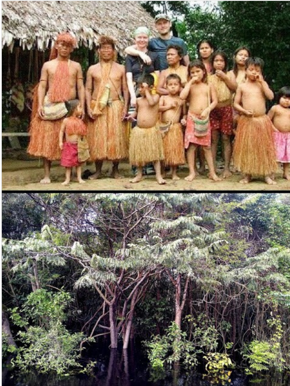
A photo of a Piraha tribe (above) and the Amazon jungle where they live (bottom)

A person who carefully studied the Piraha language wrote: "To the verb stem are appended up to 15 potential slots for morphological markers that encode aspectual notions such as whether events were witnessed, whether the speaker is certain of its occurrence, whether it is desired, whether it was proximal or distal, and so on. None of the markers encode features such as person, number, tense or gender."