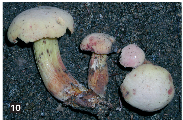
Figs 7-10. Fruit bodies of: 7-8 – Boletus permagnificus (SOMF 25 428 – 25 433); 9 – B. persicolor (SOMF 25 434); 10 – B. persicolor (SOMF 25 437)