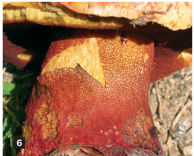
Figs 1-6. Fruit bodies of: 1 – Boletus depilatus (SOMF 25 422), photo L. Georgiev; 2-3 – B. depilatus (SOMF 25 423); 4 – B. dupainii (SOMF 25 436), photo L. Georgiev; 5-6 – B. luteocupreus (SOMF 25 424)