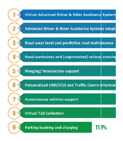
Fig. 4. Use Cases - Target applications prioritization.

Stakeholders think that the increased potential to enhance traffic safety together with the revolutionary technological solution which takes advantage of C-ITS and the target to be low-cost, communication accurate and real-time personalised constitute the main advantages and benefits of the system against relevant C-ITS solutions.