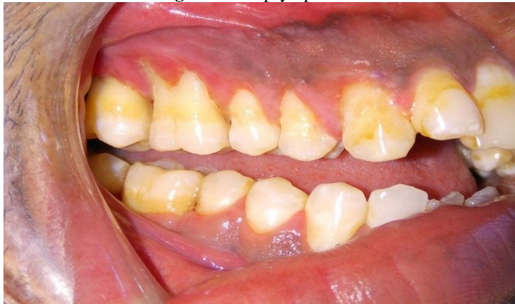
Figure 4:- 6 Month postoperative view of PCG involved site