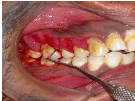
Figure 1:-Grade III Gingival Enlargement & Probing Depth