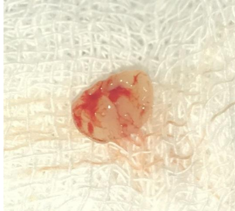
Figure 3:- Biopsy Specimen