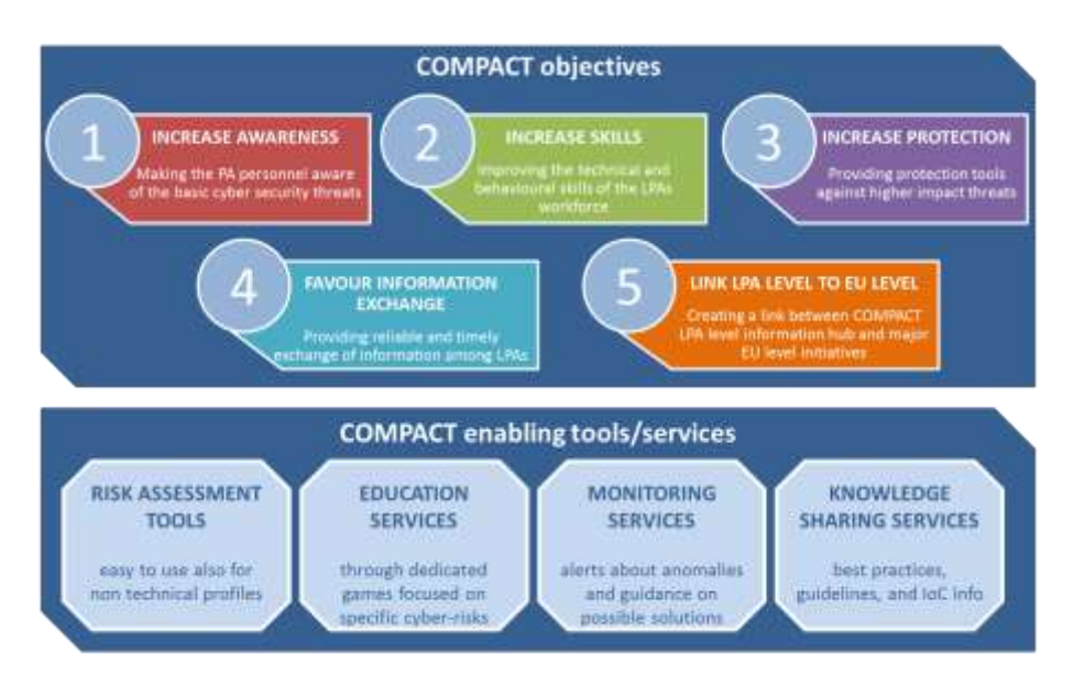
Fig. 1. COMPACT objectives

• Objective #5 - Creating a link between COMPACT LPAs level information hub and major EU level initiatives, for supporting LPAs to improve cyberresilience in a complex European context.