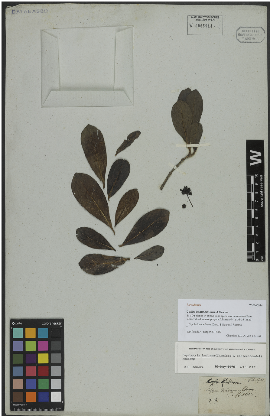
Figure 1. Lectotype of Psychotria kaduana (Cham. & Schltdl.) Fosberg collected by L.K.A. von Chamisso during the Romanzoffian Expedition in 1817 (L.K.A. von Chamisso s.n., W-Endl. 0065914). The sheet originates from the private herbarium of S.L. Endlicher, now preserved at the Herbarium of the Natural History Museum, Vienna.