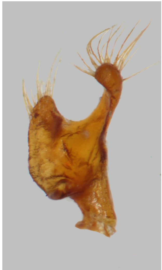
Fig. 4. Coridiellus lenoiri , paramere.

Hitherto known only from the Democratic Republic of the Congo (Schouteden 1909; Durai 1987; Lis 1990; Rolston et al. 1996). Records from Tanzania (Durai 1987: 192) were given in error (see: Lis 1990). First record from Zambia.