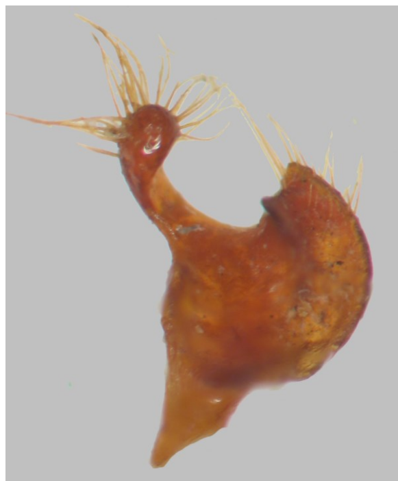
Fig. 2. Coridiellus bechynei , paramere.