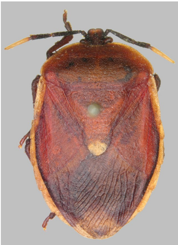
Fig. 3. Coridiellus lenoiri , body dorsal view.

Known only from Guinea, so far (Villiers, 1956; Durai 1987; Rolston et al. 1996). New to the Democratic Republic of the Congo and Zimbabwe.