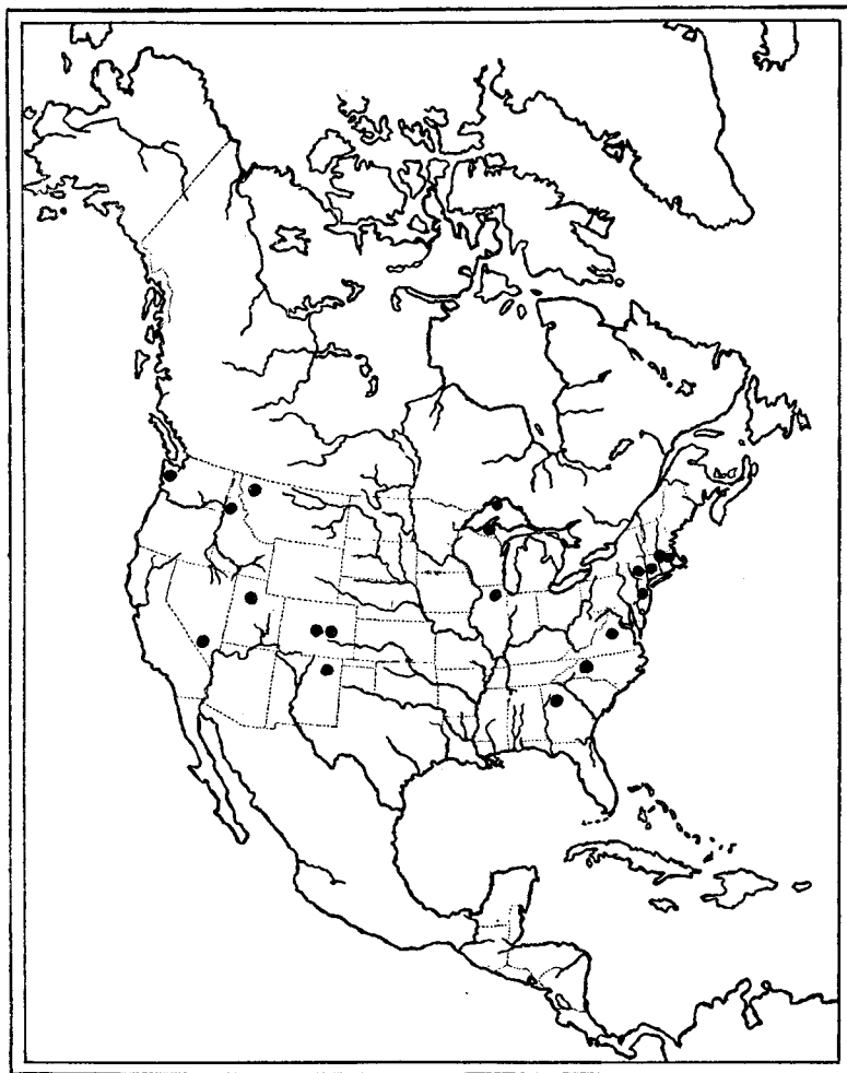
FIG. 4.— Distribution of the forms of the Formica microgyna group.