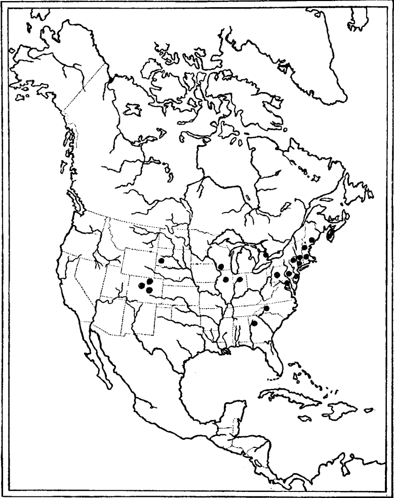
FIG. 5.— Distribution of the Nearctic forms of the Formica exsecta group.