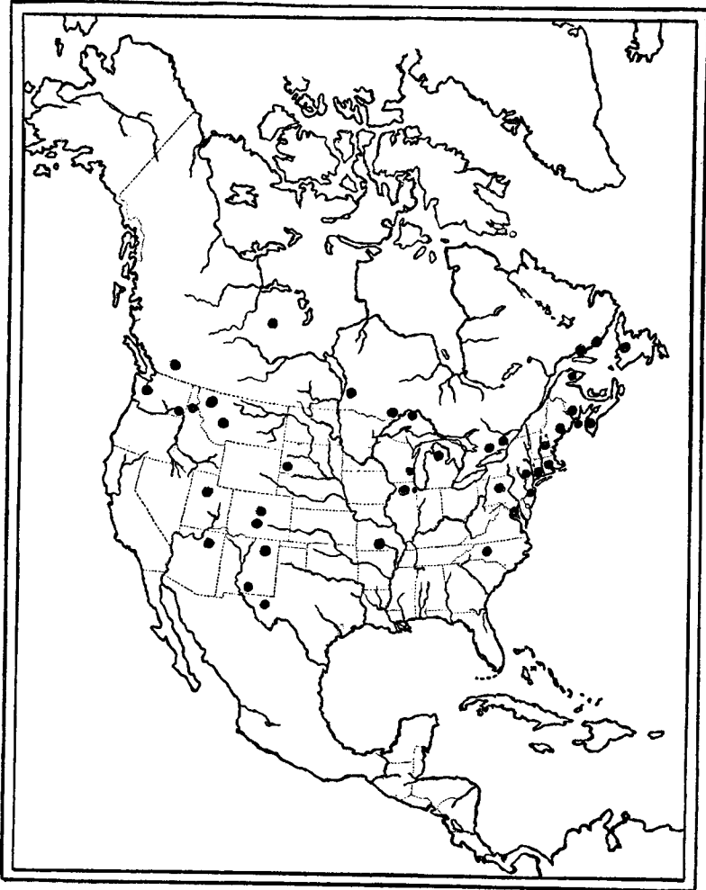
FIG. 1.— Distribution of the Nearctic forms of Formica sanguinea .