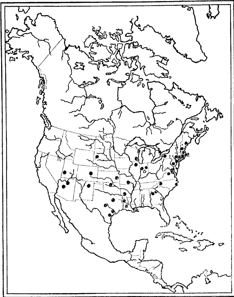
FIG. 10.— Distribution of the subgenus Neofornica .