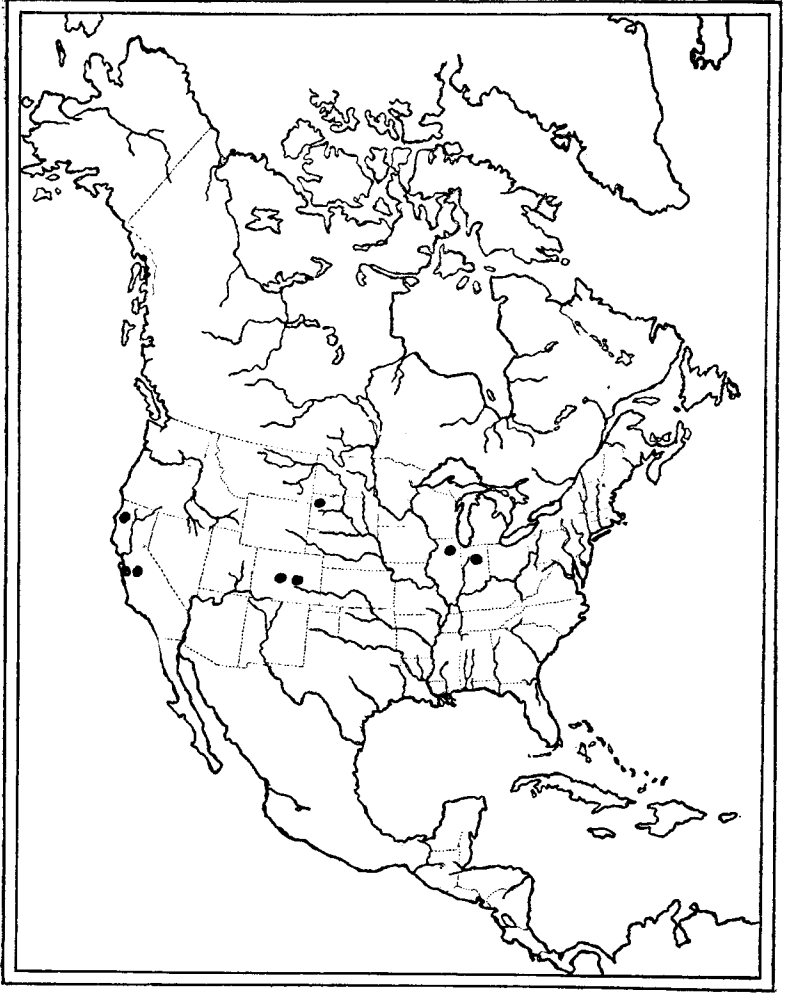
FIG. 8.— Distribution of the Nearctic forms of Formica cinerea .