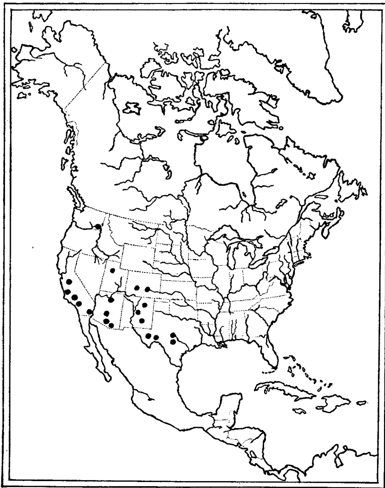
FIG. 7.— Distribution of the Nearctic forms of Formica rufibarbis .