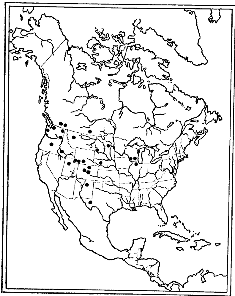
FIG. 2.— Distribution of the Nearctic forms of Formica rufa .