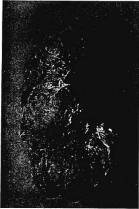
Clips adhering to the inferior thyroid stump of an enucleated intrathoracic goitre (slightly reduced).