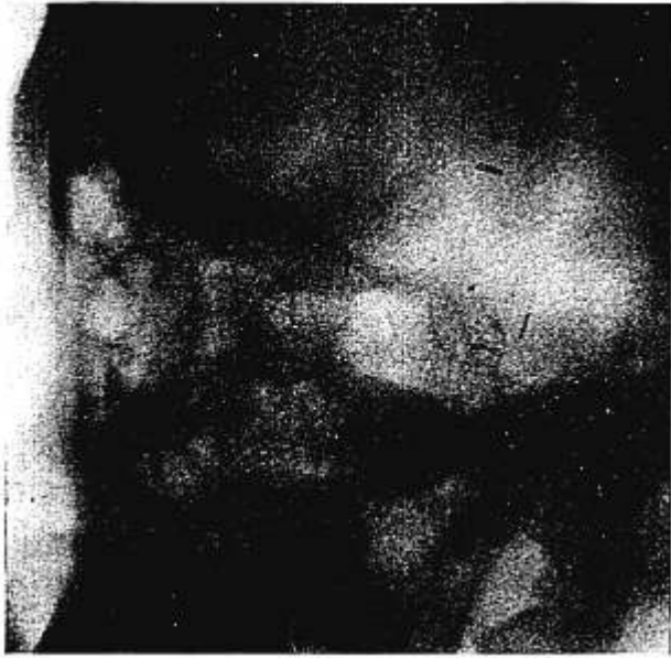
X-ray of a patient's head after subtemporal decompression, during which four clips were placed on bleeding points in the dural margin. Showing unobstructed view of normal sella turcica, two of the clips being in line with its posterior border.