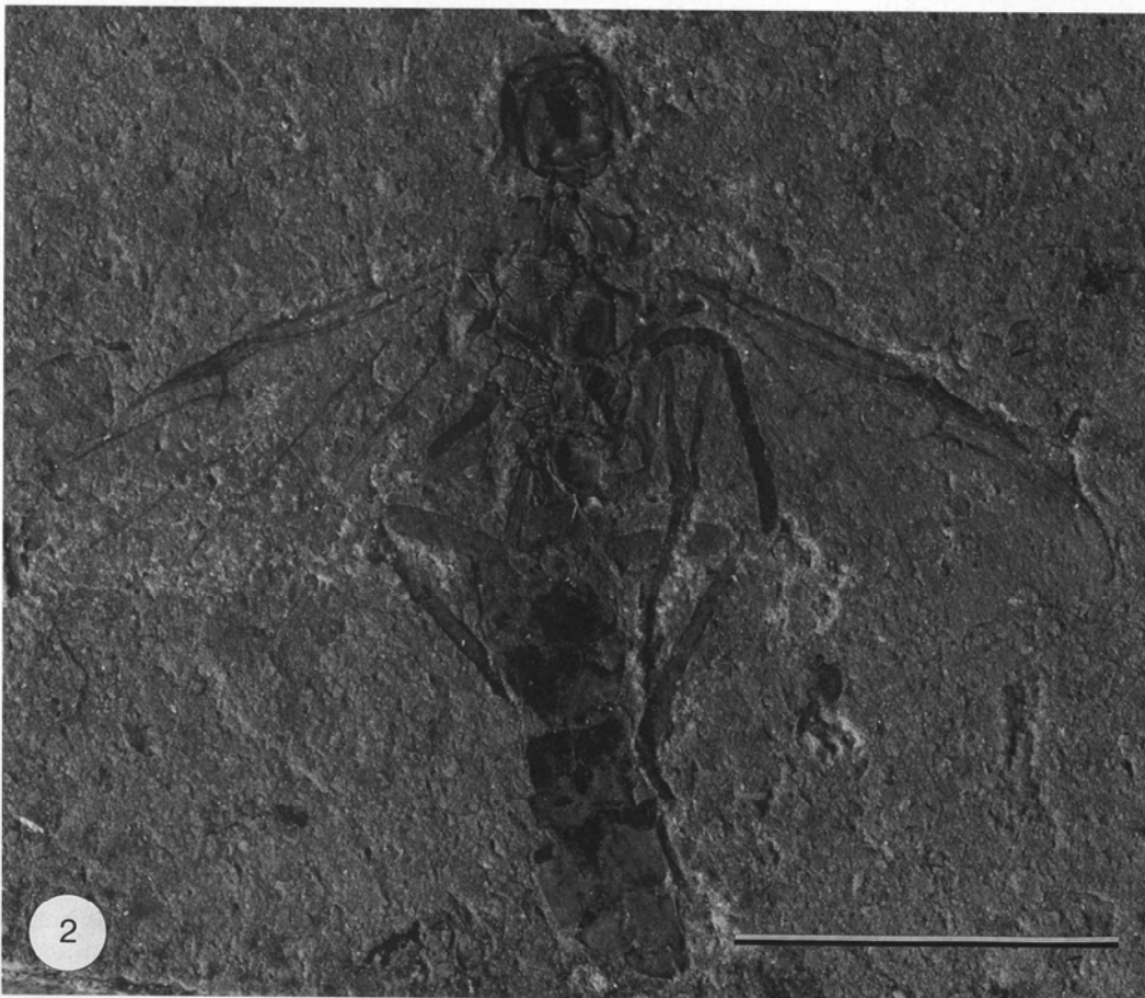
Figs. 1-2. Specimens of fossil Pelecinidae. 1, Pelecinopteron tubuliforme , lateral view of metasoma; scale line = 2 mm. 2, Iscopinus baissicus , holotype.; scale line = 5 mm.