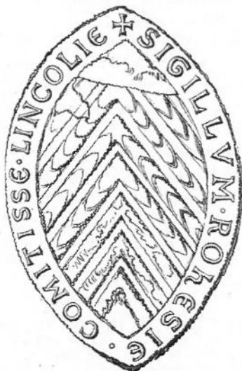
SEAL OF ROHAIS DE CLARE, COUNTESS OF LINCOLN.