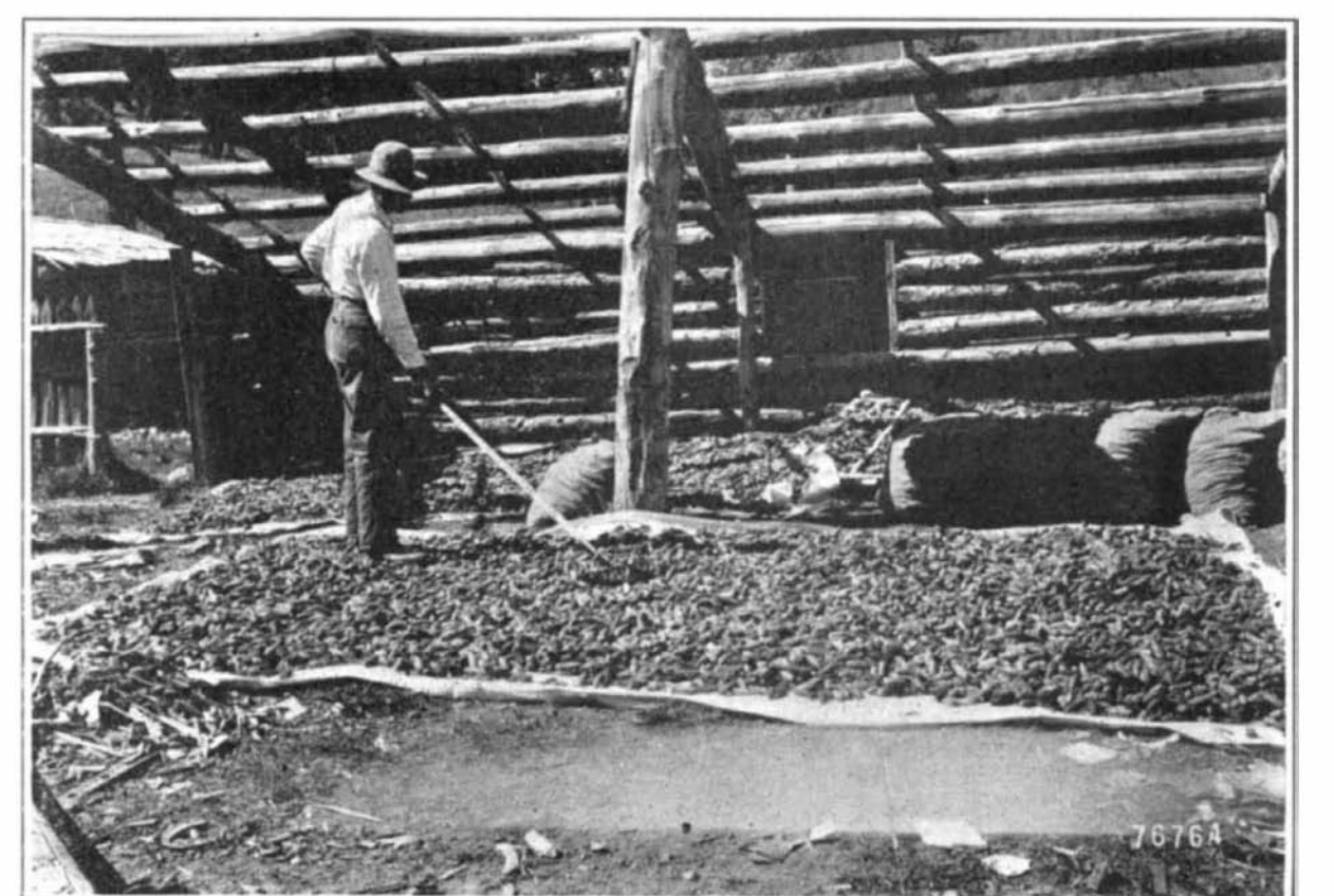
Spreading out pine cones for seed.

The logging and milling operations of the Emporium Lumber Company are situated on the east side of Cranberry Lake, within a short distance of the Ranger School, and the holdings of the Higbie Lumber Company and the Newton Falls Paper Company are also a short distance away. These operations, carried on under skillful management, give the youthful forest ranger useful opportunity for the study of modern lumber-