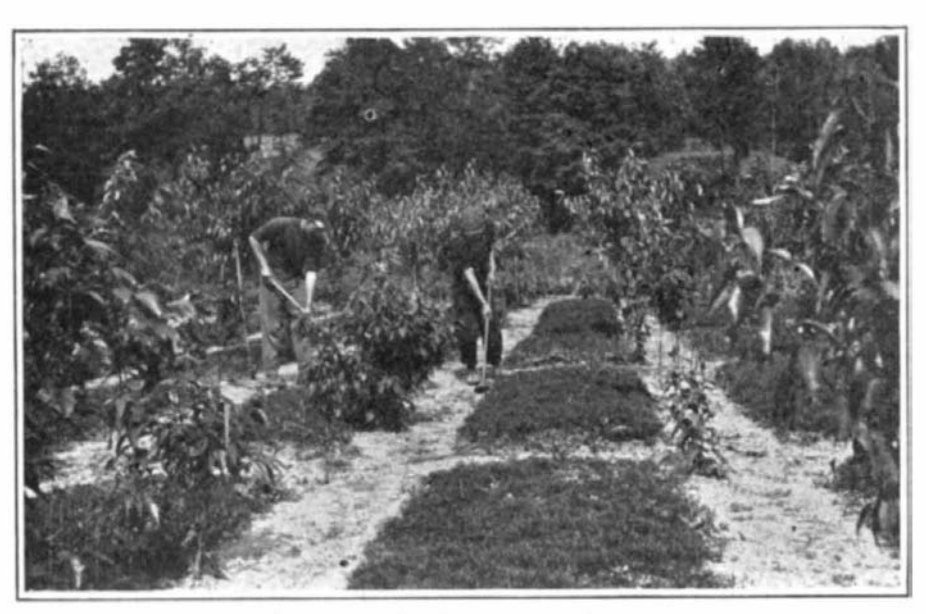
A course in landscape gardening.