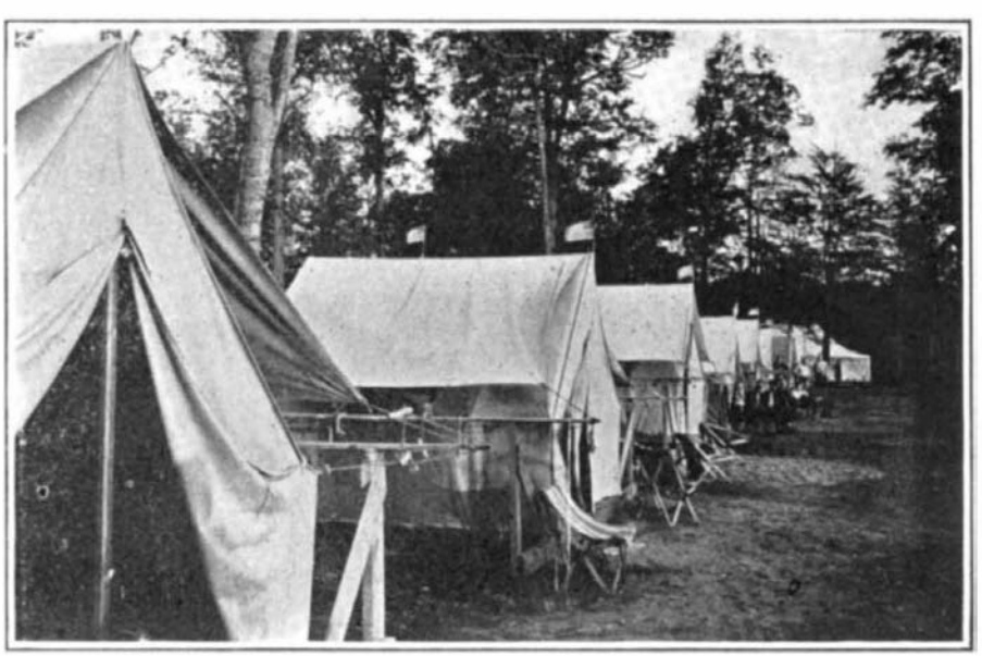
A forester camp at Lake Wanakena.