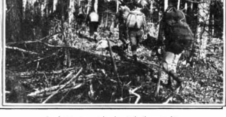
Students on a trip through the woods.

In its endeavor to make the practice of forestry as widespread as possible, the college is offering assis-