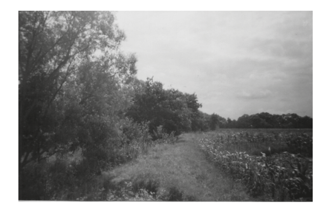
Figure. 6. Disturbance of bank-line protective zone limits, Dashava urban settlement