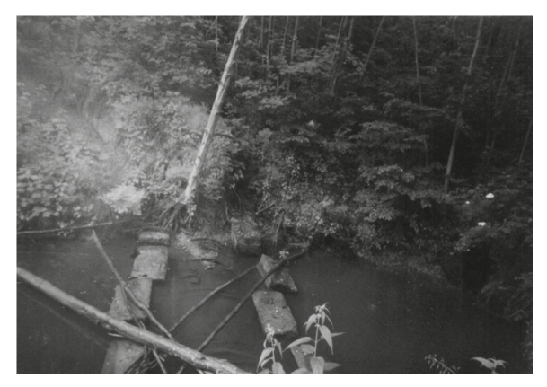
Figure 4. Product pipeline under the Berezhnytsya river stream-way