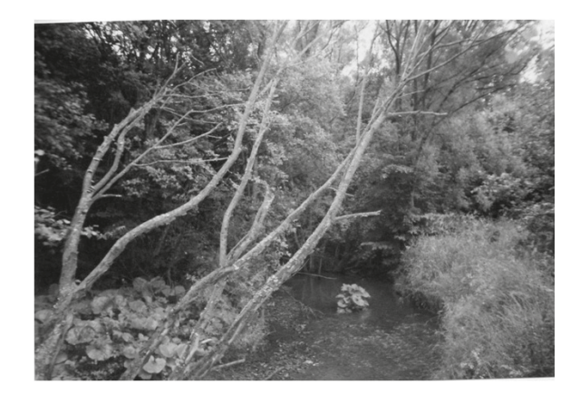
Figure 3. Aquatic and flood-plain vegetation at the first study segment along the Berezhnytsya river