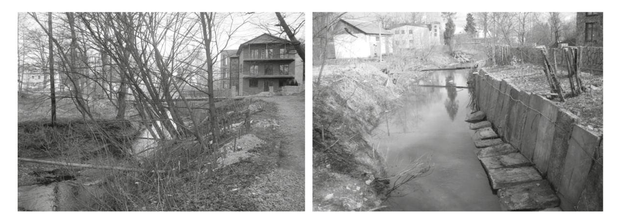
Figure 5. Disturbance of limits of bank-line protective zone, Morshyn city

part is related to segments being in a "good" condition.