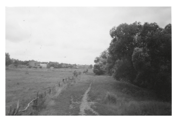
Figure. 7. Degraded flood-plain vegetation, the Berezhnytsya river (Yosypovychi village)

Next two segments are very similar to each other and for this reason we consider them as one. These segments stretch from Yosypovychi village to Berezhnytsya village. Their condition is assessed as "satisfactory" because most of the flood-plain is covered with damaged or degraded agrobiocenoses, and the livestock permanently grazes here (Figure 7). The aquatic vegetation is very poor. The limits and regimen of bank-line protective zone is disturbed.