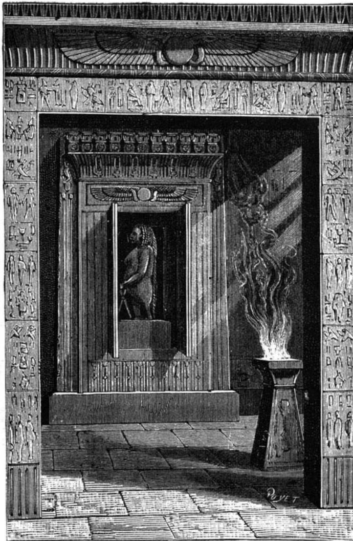
MYSTERIOUS CHAPEL OF HERON.