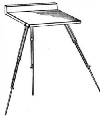
Stand for taking stereoscopic views.

this camera the following scheme was hit upon: To start with, a stand was made with three legs and a flat top fifteen inches square. A lath was secured to the top at one edge, forming a guide rail against which the camera was set. With this simple contrivance stereoscopic views were easily obtained. The camera was set on the stand against the lath, but a little to one side of the center, and the focusing was done carefully on the ground glass. The lens was stopped down in order to bring out details clearly. After exposing one plate the camera was moved sidewise and a second view was taken. For objects near by the camera was moved laterally about three inches, but for distant objects and scenes, the lateral displacement was as much as a foot. In this