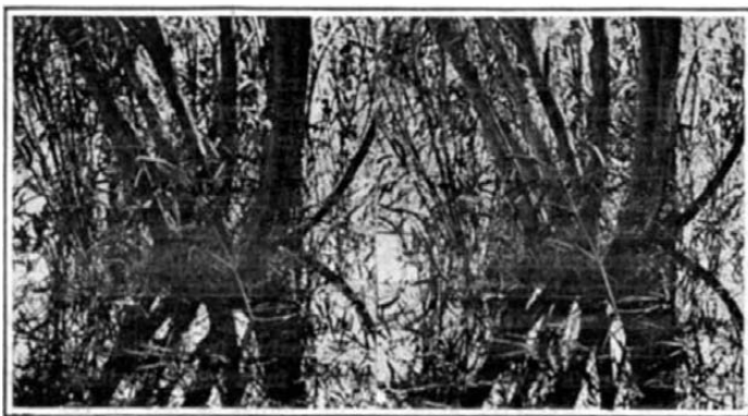
Stereoscopic picture taken with a single lens.

THE writer possesses a 5 × 7 camera with an exceptionally fine lens and with a double extension bed. Desiring to take some stereoscopic views with