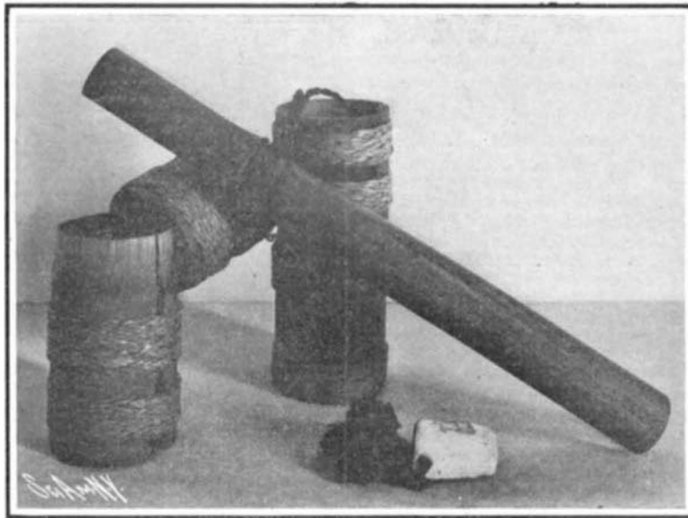
MORO FIRE MAKER. BAMBOO TO BE STRUCK WITH CHINA AND TINDER.

It was found some eighteen months ago by whalers