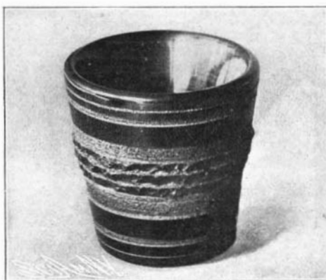
A CUP CUT FROM A BLOCK OF COAL.

"Coal-porcelain" is probably known only in the anthracite regions of Pennsylvania. Those who live in other States of the Union, with the exception of a few relic-hunters, certainly know nothing of the beau-