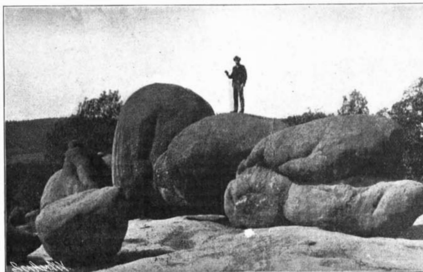
POTATO ROCK, GRANITEVILLE, MO.