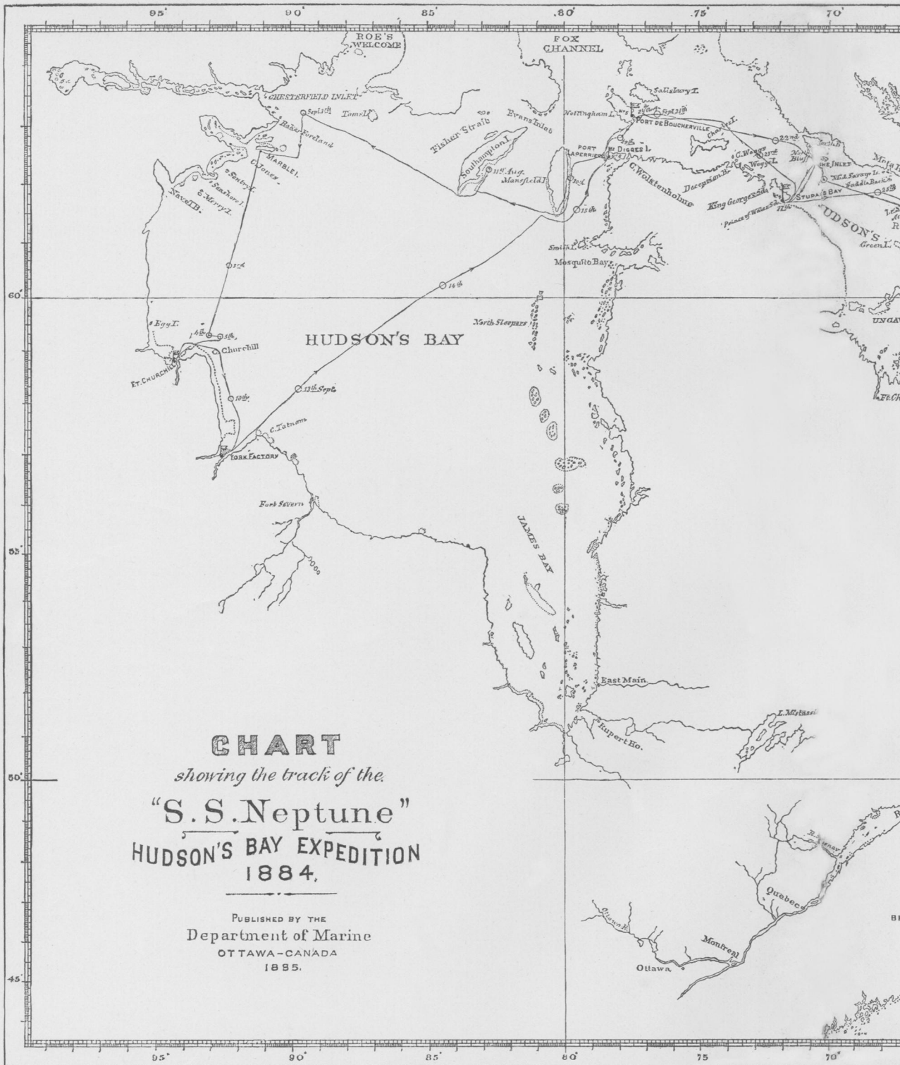
CHART showing the track of the "S.S. Neptune" HUDSON'S BAY EXPEDITION 1884.

PUBLISHED BY THE Department of Marine OTTAWA-CANADA 1885.