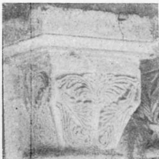
PALM CAPITAL, CHOIR-AISLE, BERNAY.