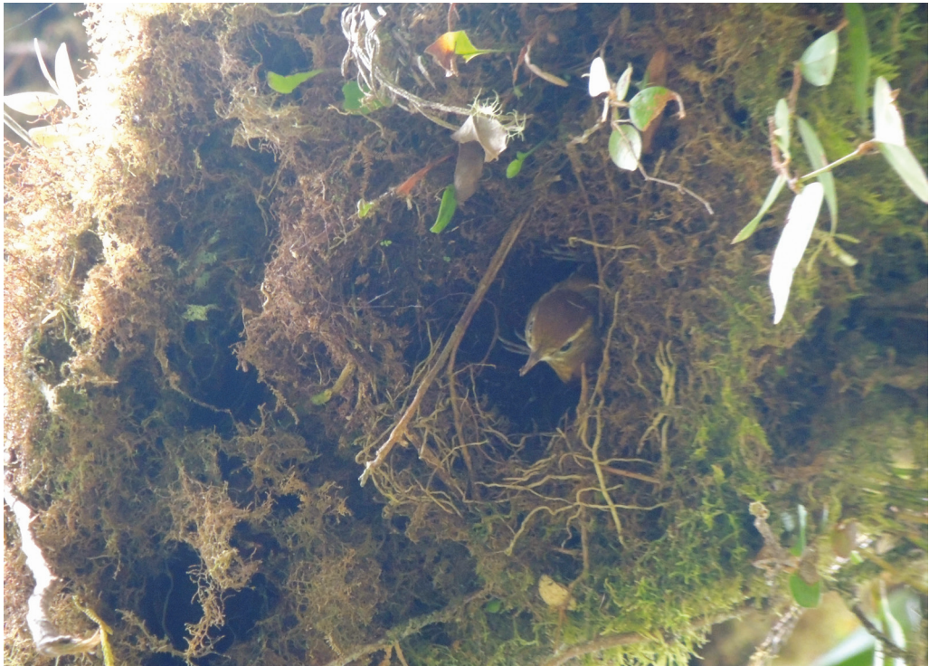
Figure 2. Nest of Ruddy Treerunner Margarornis rubiginosus , collected on June 2015, at Cerro Chompipe, Heredia province, Costa Rica (nest 3) (Ariel A. Fonseca-Arce)

materials of the inner chamber and tunnel, study the wall surroundings and measure the inner chamber dimensions (measurements 7–8, Fig. 3).