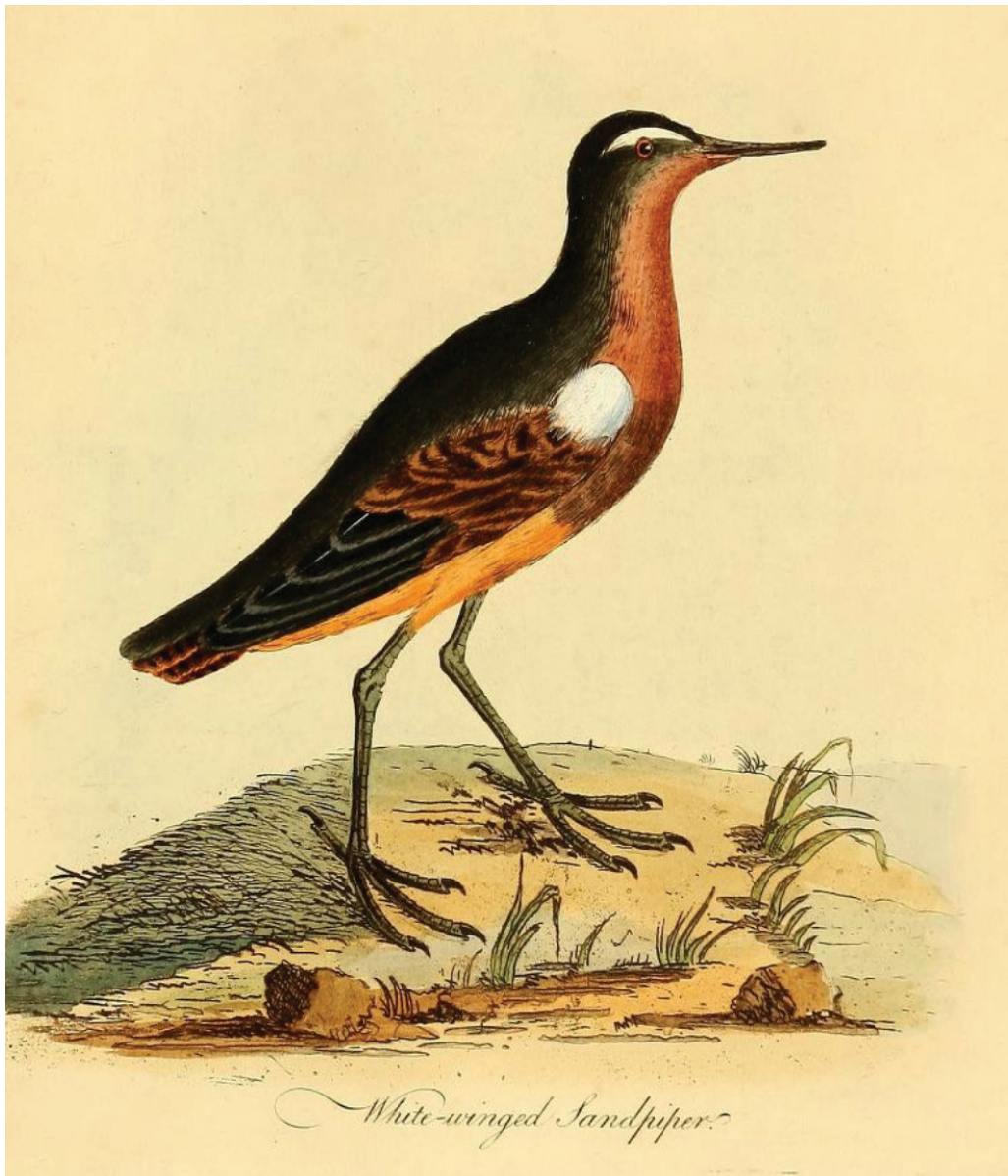
Figure 5. Tahiti Sandpiper Prosobonia leucoptera , from Latham (1824); note the white supercilium, rufous wing-coverts, and pale belly and undertail-coverts. Latham added a plate to his first publication (Latham 1785: 172–173, pl. LXXXII) and reused it in 1824 (Latham 1824: 296, pl. CLII). The plates differ notably in, for example, the supercilium, breast and undertail colorations (see Figs. 4–5) (both volumes on the Biodiversity Library are held in the Smithsonian Library). These differences may be attributable to the colourists who worked on the relevant copies during the publication process.

do known illustrations of the sole Tahiti Sandpiper specimen in Joseph Banks' collection (Figs. 4–6). It is very unlikely that birds from Moorea were morphologically distinct from those on Tahiti (as these islands are separated by just 18 km). Also, there is evidence of individuals exhibiting patchy white feathers in several Polynesian Acrocephalus warblers (Thibault & Cibois 2017), which could be evidence of a limited gene pool and explain the minor variation in the meagre sample of sandpipers.