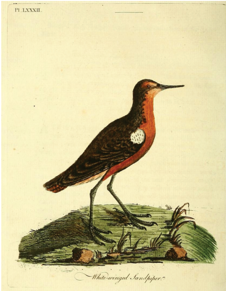
Figure 4. Tahiti Sandpiper Prosobonia leucoptera , from Latham (1785); note the pale undertail-coverts and rufous supercilium