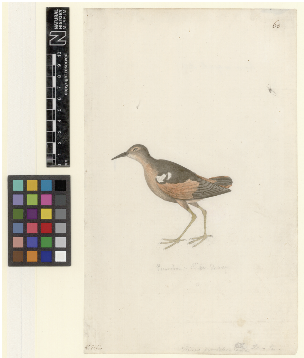
Figure 2. Moorea Sandpiper Prosobonia ellisi , Moorea, August–December 1777; the claws are not coloured, indicating that the illustration was unfinished, and the annotation Prosobonia ellisi was added by Sawyer (Sawyer 1949) (William Wade Ellis, © Natural History Museum, London)

ten points: bill shape and thickness, ear patch colour, throat colour, tibia feathering, tail pattern, wing-coverts pattern, tail and wing lengths, and leg and underparts colorations. The Webber illustration differs in having a supercilium (absent in Ellis'), only a single patch of white on the wing-coverts (not two), and differently patterned median and greater coverts. The rump is ferruginous, but the same feature is present on the surviving specimen (Jansen et al. 2021).