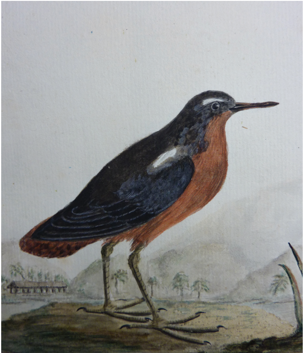
Figure 6. Tahiti Sandpiper Prosobonia leucoptera , from the Latham MS collection; note the all-rufous tail. The plate is unsigned and by an unknown artist; it is annotated with a cross-reference to the description in Latham (1824: 296) and appears to be a copy of Forster's plate (Fig. 1), albeit with some differences, e.g., tail length, posture, bill length and leg colour. Latham's 888 original illustrations of birds in six volumes were acquired by the British Museum from Mrs E. Wickham on 24 November 1920 and are now at the Natural History Museum (NHMUK) (Latham n.d., Sawyer 1949, Jackson 1999, Jackson et al. 2013).

We consider the differences between Moorea and Tahiti birds to represent age, sex, season or inter-island variation, rather than evidence of a separate taxon. It is possible that future work testing ancient DNA of archaeological remains on Moorea may resolve this issue, but until then we conclude that Prosobonia ellisi Sharpe, 1906b, is a junior synonym of Tringa leucoptera J. F. Gmelin, 1789.