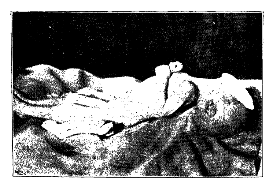
Shows the patient in the third week of illness.