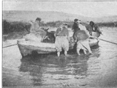
THE JORDAN FERRY.

In the previous articles on modern Palestine the extreme conservatism of the Orient has been frequently referred to, but in nothing is it more manifestly exhibited than in the subject of the present one. In essential features the dress of the common people has remained almost unchanged from the earliest historical periods.