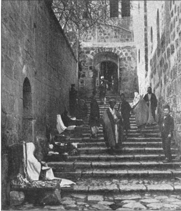
STREET COSTUMES IN JERUSALEM.

their head-dress or spend it on jewelry—bracelets, earrings, etc. Anklets are seldom worn today, and rings are generally of common quality. Among men of any position one ring is generally carried—the signet ring, 13 as all official documents must be sealed. The seal, which may of course be not on a ring but