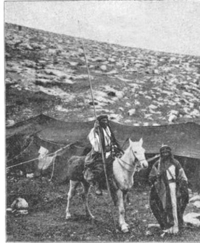
THE GARB OF THE BEDOUINS.

Among men the hair is commonly shaved periodically, but, if long enough, is combed straight forward, without parting. Many wandering dervishes have long hair, uncut, untrimmed, and without cover; some tribes of bedouins also wear it long. The great 'Aneezeh tribe is said never to cut their hair at all. The Jews do not as a rule shave their heads, and are particular to allow the locks of hair just in front of the ears to grow uncut. Many of them—especially the strict Polish Jews ( Ashkenazim ) and the Yeminites from Arabia—curl these locks, giving to themselves a very peculiar appearance. Orientals think much of the beard. To shave the chin is allowable in the youthful, except among the