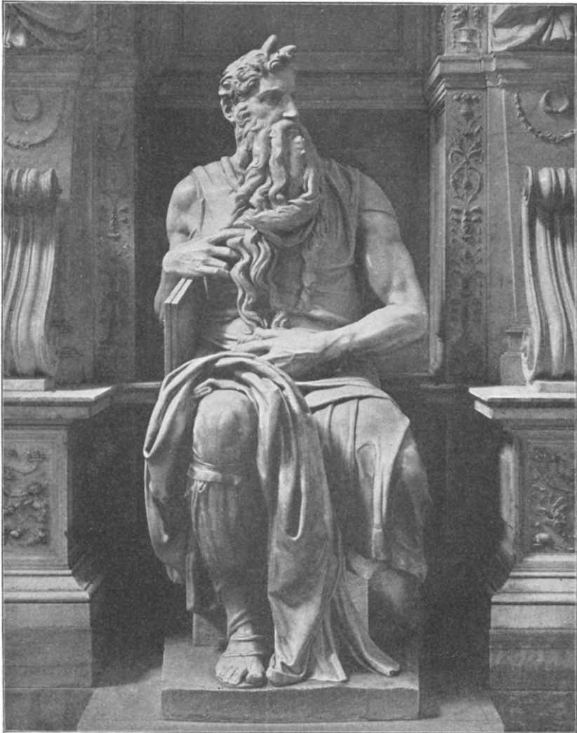
MOSES.— Michael Angelo.