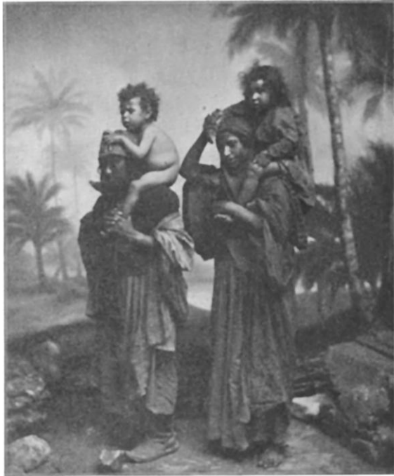
BEDOUIN MOTHERS AND CHILDREN.

In conclusion, a word may be added about personal adornment apart from clothes. The application of kohl to the eyelids is a custom with all classes. 21 This is a fine black powder which