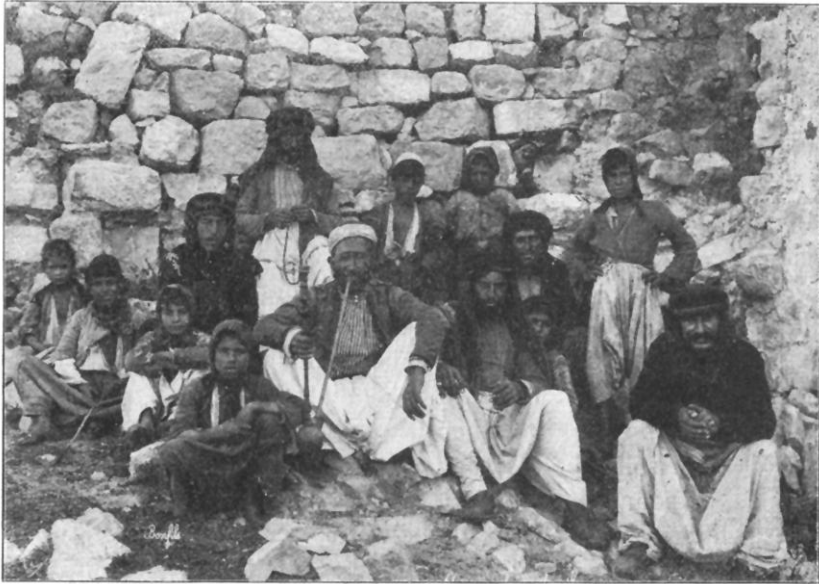
A GROUP OF METAWILEH, SHOWING THE NATIVE DRESS.

The head-dress of the village women is conspicuous and distinctive. Maidens usually have little more than a simple handkerchief—the wakah , or “protector”—which is often ornamented