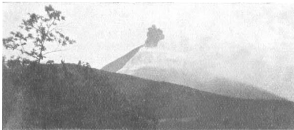
FIG. 2.—Vesuvius as seen from the Observatory Ridge, May 29, 1905.

A few hours after the first, a second outlet was formed, then a third, "B," both lower down, at an altitude of