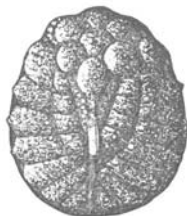
FIG. 1.— Cyclus Woodwardi , Reed. The original specimen is in the Woodwardian Museum, Cambridge, and was obtained from the Carboniferous Limestone, Settle, Yorkshire. Magnified \frac{3}{4} nat. size.