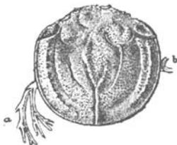
FIG. 2.— Cyclus testudo , Peach; Langholm. Enlarged 4 times natural size.

One specimen, however (discovered amongst those obtained by Mr. Stock from Eskdale), besides exhibiting a number of fragments of appendages, scattered irregularly over the surface of the matrix, shows one of the middle limbs in position, still attached to a shield