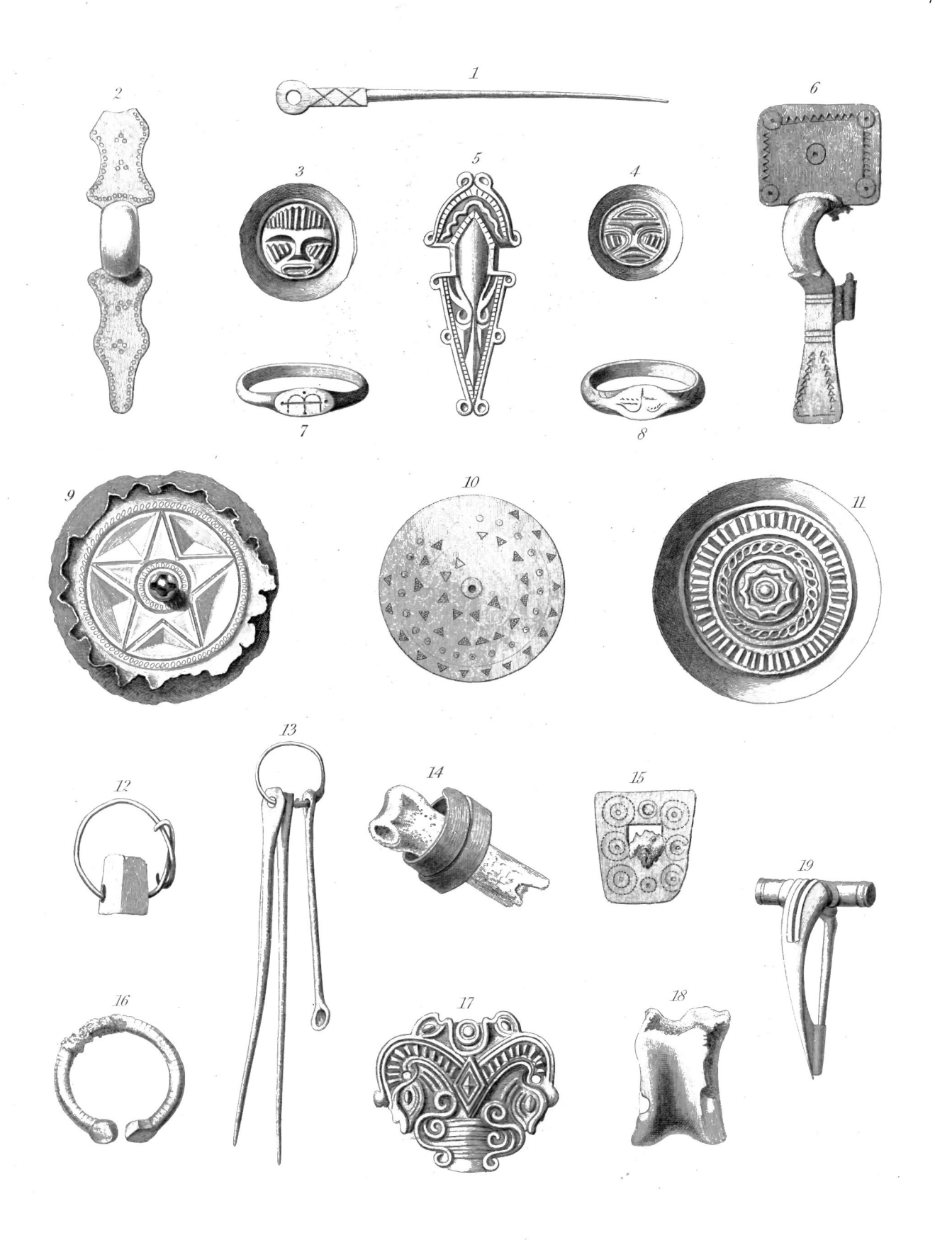
FIBULAE, RINGS, ETC. found at Harnham Hill, Salisbury.