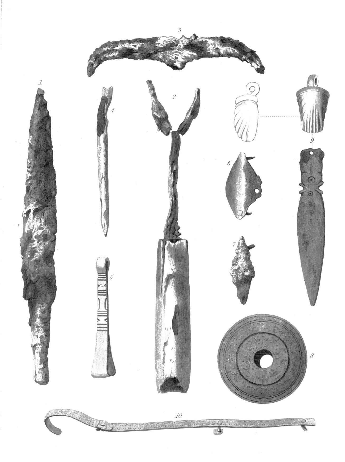
STEEL, KNIFE, FORK, ETC. found at Harnham Hill, Salisbury.