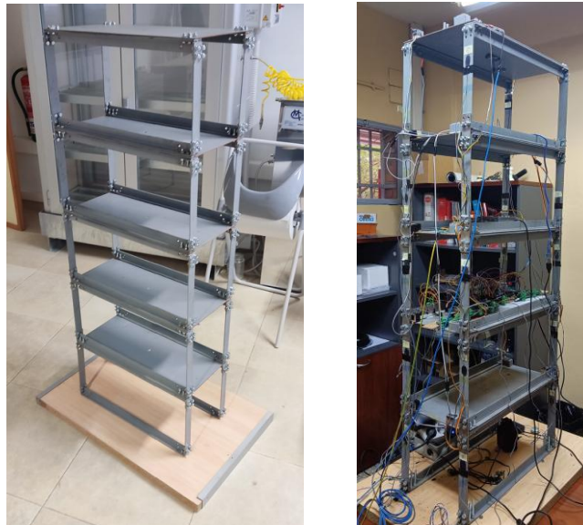
Figure 1. Steel frame before (left) and after (right) the instrumentation.

The test structure is a steel frame comprising five levels, as depicted in Figure 1. Each level consists of a 500 × 250 mm slab supported by two beams. The beams are built from T-profiles (base and height of 30 mm, thickness 4 mm), and the columns have a 30 × 2 mm rectangular cross-section. Beam-to-column joints are assembled using small angle brackets fastened with screws.