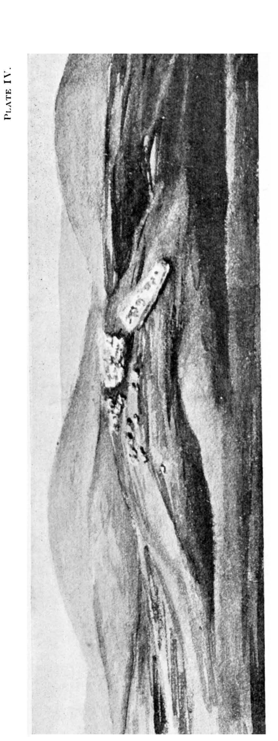
THE BARROW-from an old drawing.