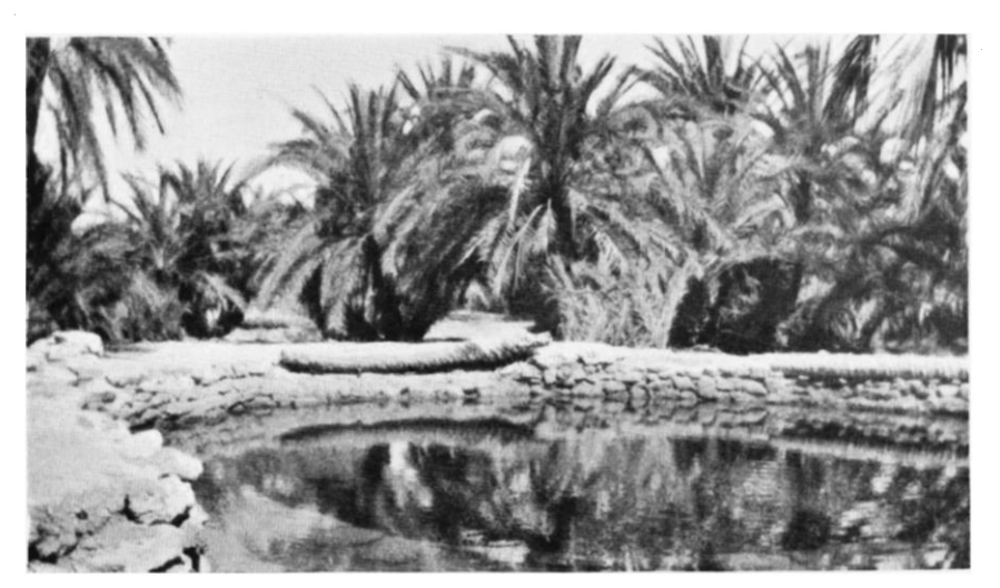
THE SPRING OF TAMUSI