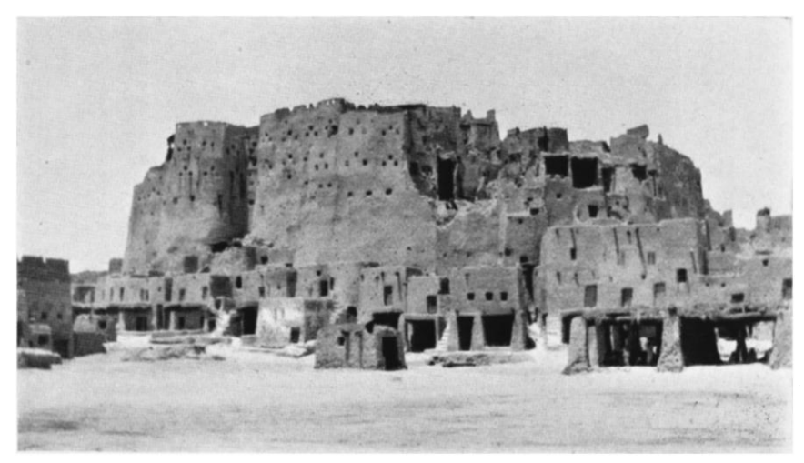
SIWA TOWN FROM THE NORTH