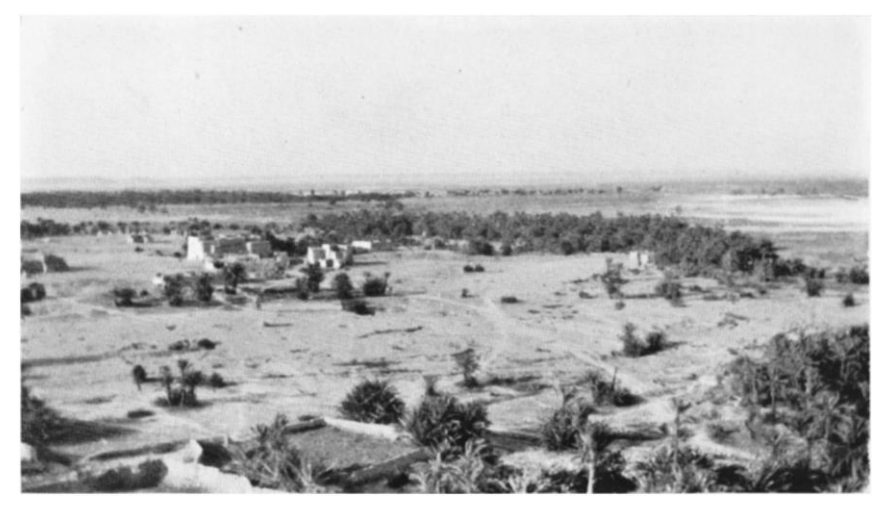
THE OASIS FROM THE TOP OF SIWA