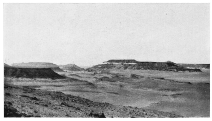
ENTRANCE TO THE OASIS BY THE MAQAHHIZ PASS