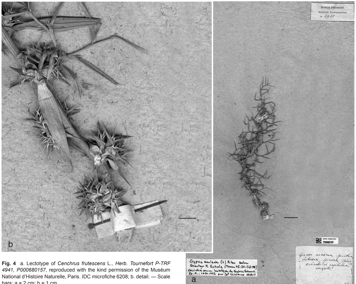
Fig. 4 a. Lectotype of Cenchrus frutescens L., Herb. Tournefort P-TRF 4941, P000680157, reproduced with the kind permission of the Muséum National d'Histoire Naturelle, Paris. IDC microfiche 6208; b. detail. — Scale bars: a = 2 cm; b = 1 cm.