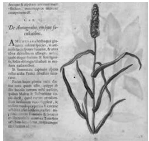
Fig. 1 Amongeaba Piso, De medicina brasiliensi : 120. 1648.