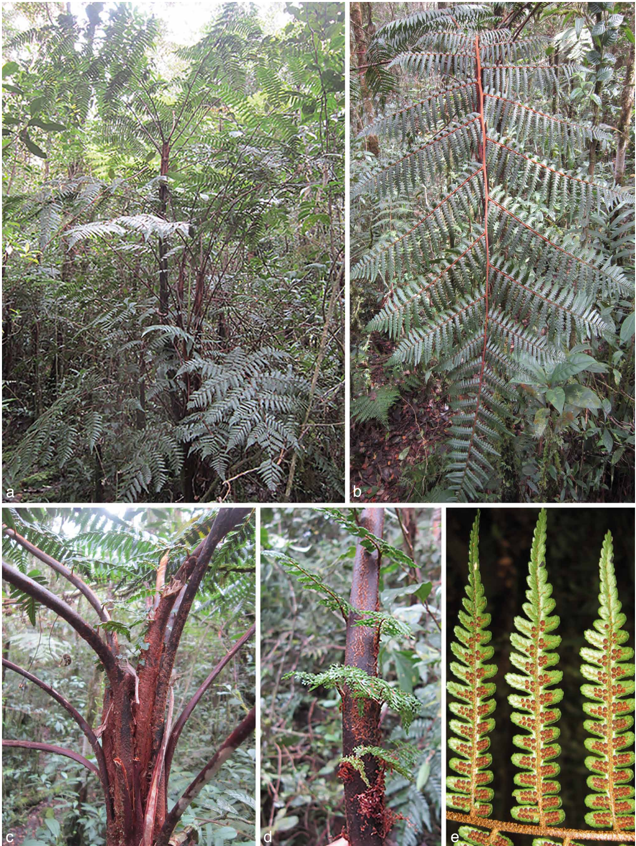
Fig. 1 Alsophila commutata Mett. a. Habit, showing branching trunks; b. lamina outline; c. petiole; d. gradually reduced basal pinnae, lowest one skeletonized; e. sori.

5 cm long, evanescent with age, the strong costae remaining as blunt spines, aphlebiae either separated by gap from rest of the normal pinnae (Sumatra to Borneo) or transient with them (Sumatra, Philippines). Petiole scales marginate with one apical setae (often broken off), concordantly bicolorous, lanceolate to ovate, 8.0–10.0 by 1.5–2.0 mm, tips weakly heli-