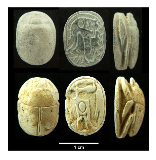
Fig. 6: Scarabs from the Tyre al-Bass cemetery (Boschloos 2015a: fig. 5.14, 5.16)