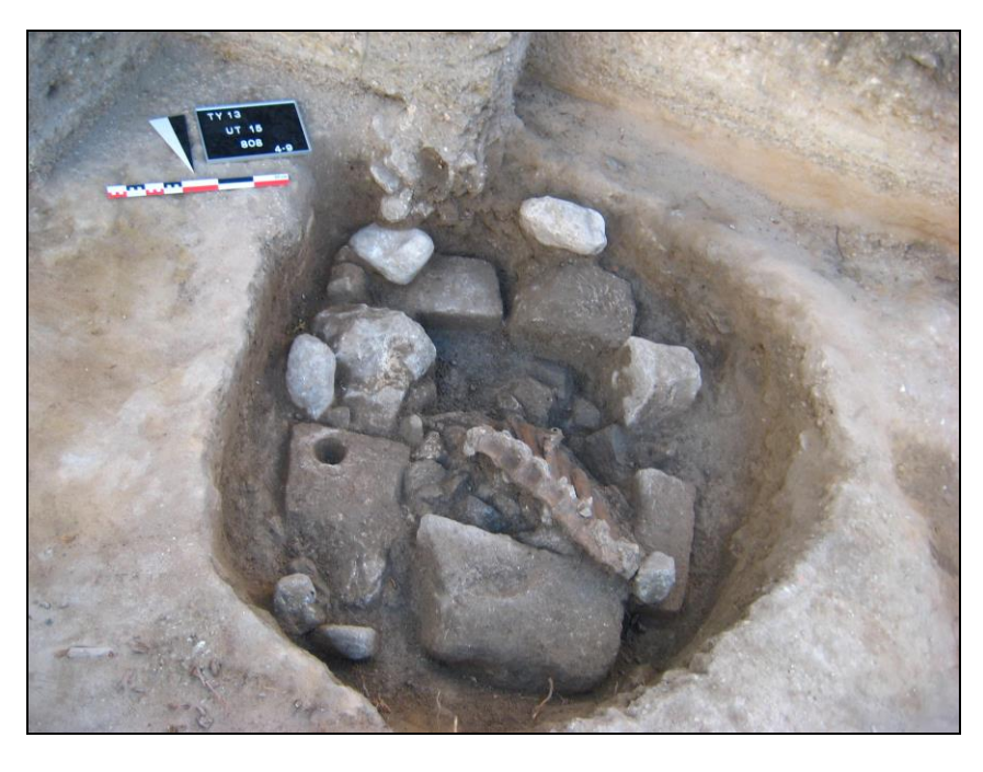
Fig. 5: Lowest level of Hellenistic pit in western part of Unit 15 during excavation