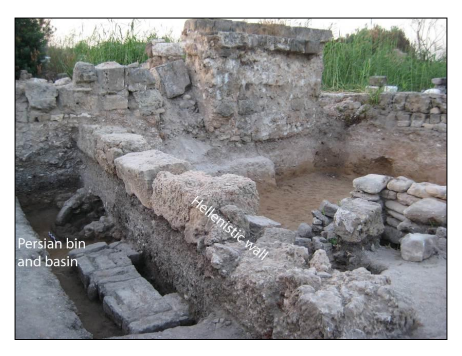
Fig. 4: View of southern part of Unit 15, with Persian basin and bin, underneath remains of the Hellenistic outer wall of the sanctuary