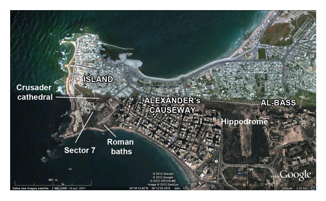
Fig. 2: Satellite view of modern Tyre with location of main archaeological sites discussed in this article

Since the 18<sup>th</sup> century, the archaeological activities have focussed on two main areas: in the east the al-Bass quarter with the necropolis and the hippodrome, and in the west, on the original island, the area of the Crusader cathedral and the Roman baths (Fig. 2). Large-scale excavations started in 1946 under Emir Maurice Chéhab, who uncovered most remains in the two zones, resulting in the creation of vast archaeological parks (Bikai 1992). The AUB Museum excavated an area labelled Sector 7A, located in the southern part of the island site (Fig. 2).