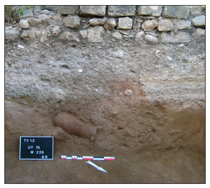
Fig. 3: Sand layer with large fragments of Phoenician jars in Unit 15 during excavation

BCE) (Fig. 3), yet no traces of occupation or industrial activities. Even though unearthed on a much smaller scale, the finds from these contexts are consistent with the ceramic material from the Phoenician levels excavated west of the Crusader cathedral (Bikai 1978) and in the al-Bass quarter (Aubet 2004; M. E. Aubet, F. J. Núñez, L. Trelliso 2015).