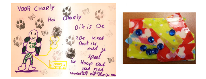
Fig. 6 Drawing and paper craft gifts

Other observations In general some children touch the robot from the first meeting on, curious about how it feels. Especially in the last session Charlie gets many questions of how it works. All children are interested in unpredictable facts about Charlie as for example the name and colors of Charlie's soccer club and the outcome of the last game. Furthermore, compliments seem to support all children: They