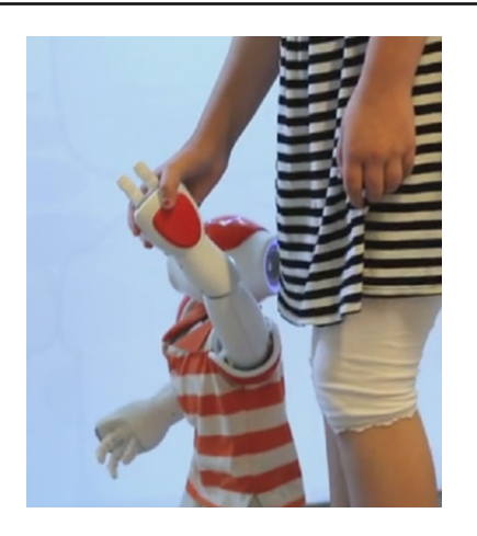
Fig. 2 Walking with the robot

and hobbies. Furthermore, the robot asked at the end of the first and second session if the child had plans for the coming weeks (until the next session) and referred back to these in the next session. Finally, during the activities the robot asked questions about diabetes. The robot for instance said "The holiday period seems to be really hard to me, with all the candy and strange food, how do you deal with that?". During the small talk and the activities the robot displayed emotions that correlated with the situation (experiment 5, 6 and 8 [6,19,37]).