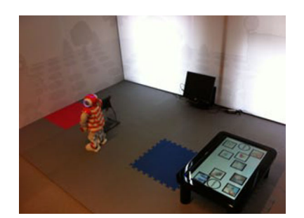
Fig. 3 The robot playground

In order to get a feeling of how diabetic children interacted with the NAO when different activities are offered and physical interaction is possible we carried out an experiment.